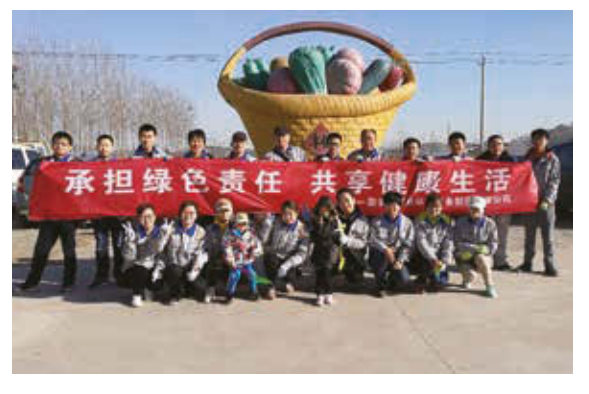
Group photo of the tree-planting activity for employees of the Group