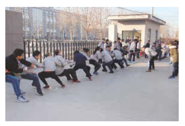
The tug-of-war of "the first employee sport event of Denox"