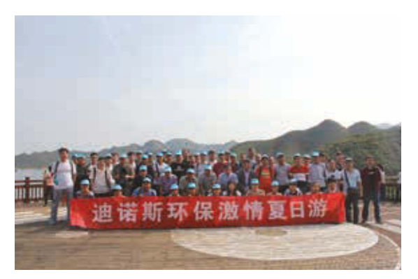
The Group organized trips for employees

Aiming to proactively create a workplace suitable for employees to work at and grow with, the Group regularly organizes trips and various activities for its employees to enrich their life and encourages them to relax and release stress.