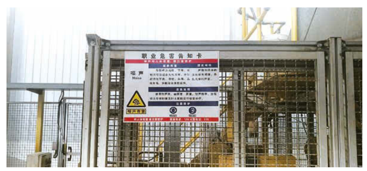
Notification card for occupational hazards posted on the production equipment of the Group

The Group has established and improved emergency response measures against fire, various kinds of emergency incidents, occupational accidents, etc. Full-range safety inspections to all projects and production sites as well as irregular random examinations on a monthly basis are conducted and regular safety meetings on safety issues are held after inspections. Moreover, measures for hazard identification and evaluation have been formulated by the Group to conduct quantitative analysis and scientific assessments and to formulate better safety management plans.