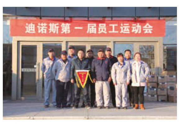
Group photo of "the first employee sport event of Denox"