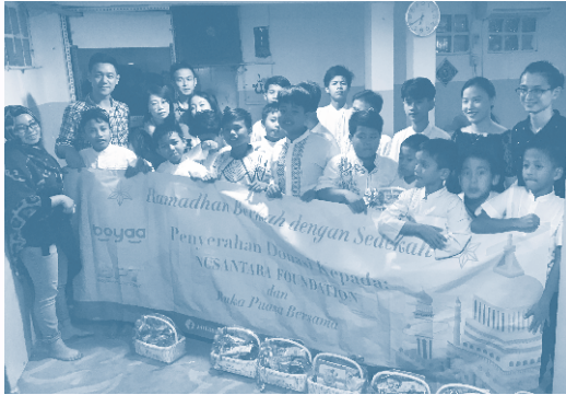
Boyaa Indonesia organising donation activities at an orphanage