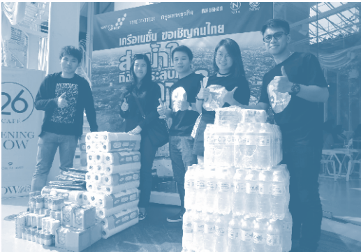
Staff of Boyaa Thailand purchasing supplies for donation

In early 2017, the most devastating flood disaster that hit the Southern Thailand in the past 30 years severely blew the local society and economy. To support the recovery of disaster, the Thailand subsidiary of the Company made use of its own resources to organise fundraising event to raise fund for flood disaster in Southern Thailand, and made use of the raised fund of several thousand Thai Baht in the games to purchase food and necessities, which have been delivered to donation centre, so as to help the victims to get through the tough times.