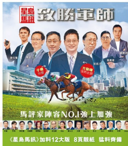
《星島馬訊》加料12大版 8頁靚紙 猛料齊備

To commemorate the HKSAR's 20th anniversary, Sing Tao Daily collaborated with Headline Daily to publish a special memorial photobook, chronicling Hong Kong's major events over the past two decades.