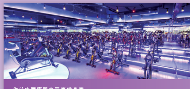
位於中國廈門之單車健身室 Spinning studio located in Xiamen, China

隨着亞太區的會員滲透率逐步追貼發達經濟體,會員滲透率稍微增長已經可以成為地方及新興業者的龐大商機,亞太區將成為全球最大的健體及健身服務消費者,可見上文的推動因素舉足輕重。再者,殷切需求結合目前的低滲透率及龐大人口,勢將開啟未開發市場難得一見的增長機遇。