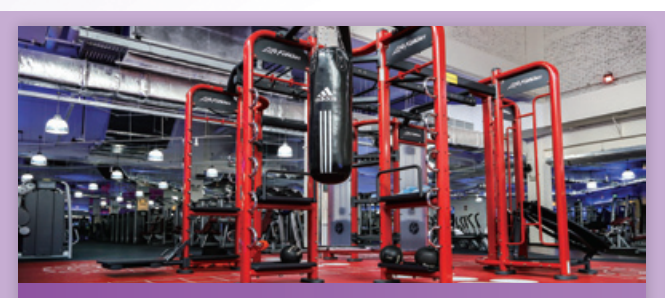
位於新加坡之健身中心 Fitness center located in Singapore