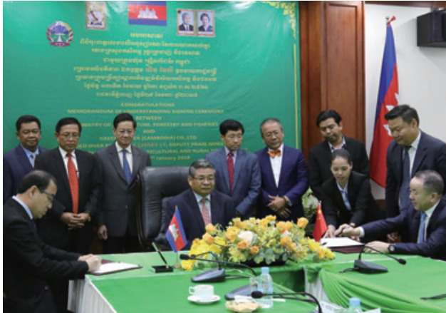
Mr. YIM CHHAY LY, the Deputy Prime Minister of Cambodia, chaired the meeting for execution of the memorandum of understanding 於簽訂諒解備忘錄會議中，由柬埔寨副首相因蔡利先生主持