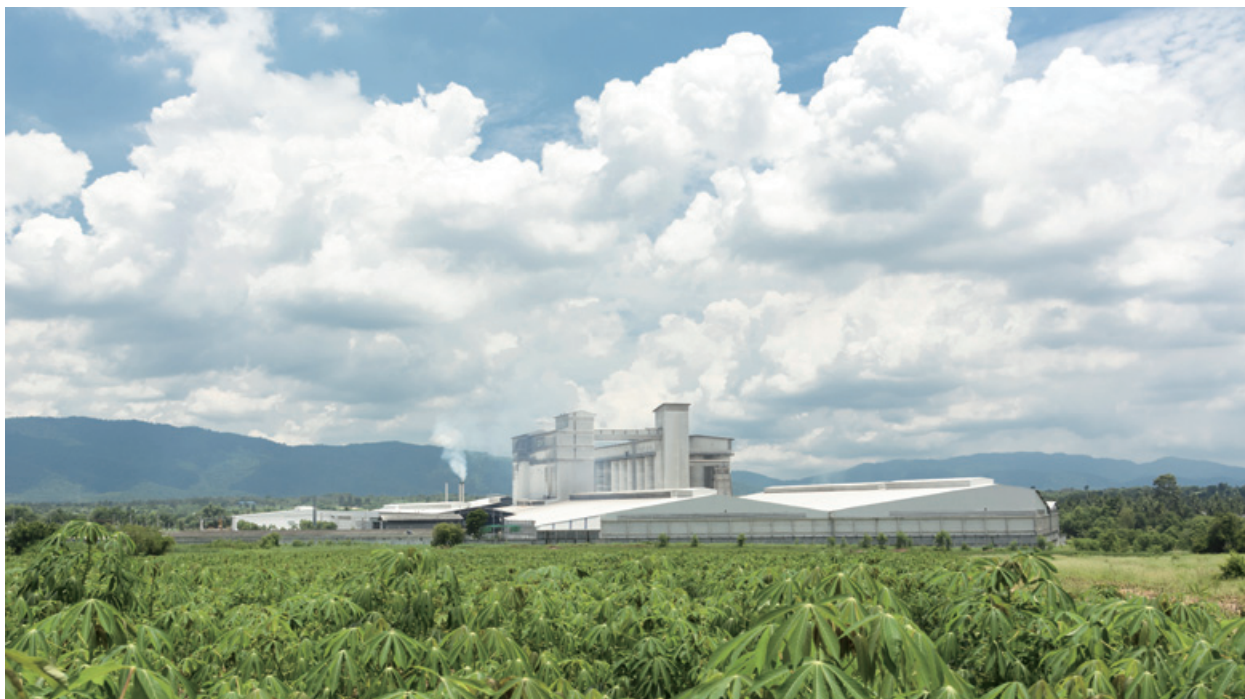
A cassava starch processing plant photo for reference