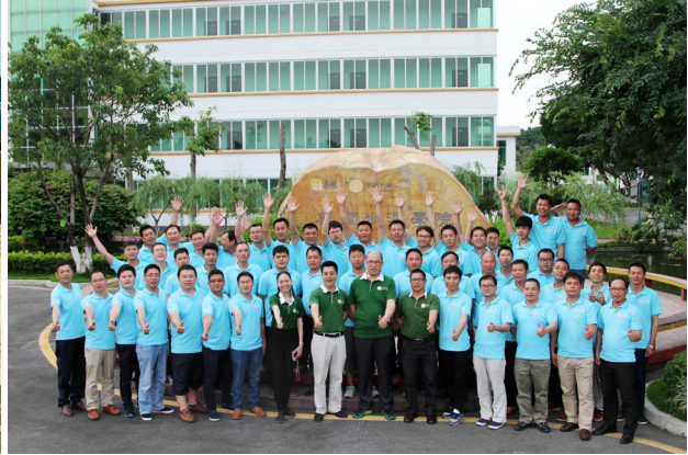
矿山安全培训 Safety Training for Mines