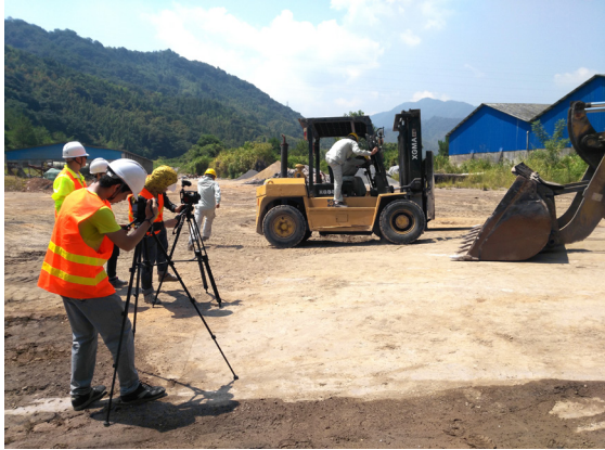
应急演练培训视频拍摄 Shooting of training videos for emergency drills