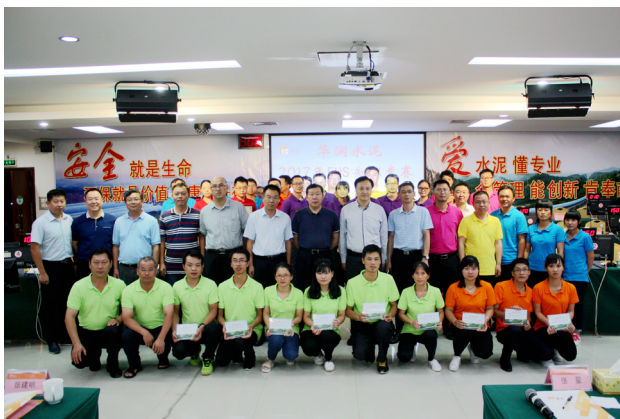
知识竞赛 Quiz Competition