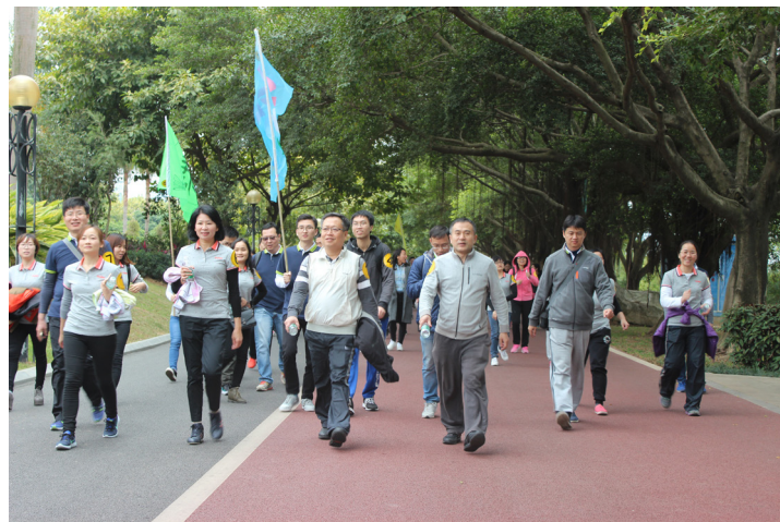
南宁共享服务中心员工徒步活动 Hiking event for staff from the shared service centre in Nanning