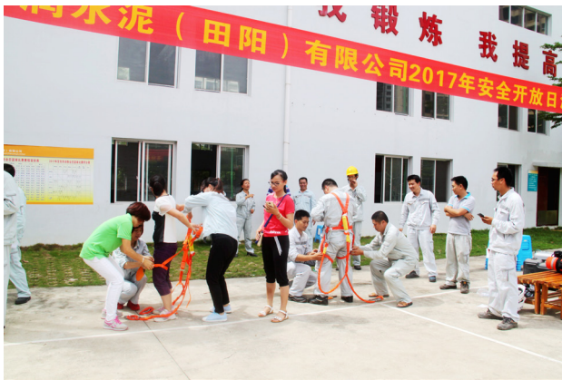
安全开放日 Safety Open Day