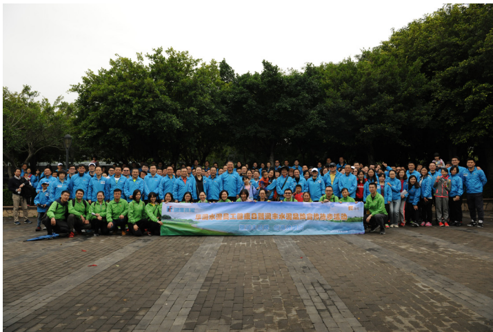
春季员工健康日暨润丰水泥品牌宣传徒步活动 Hiking event for staff health day in spring with Runfeng cement brand promotion