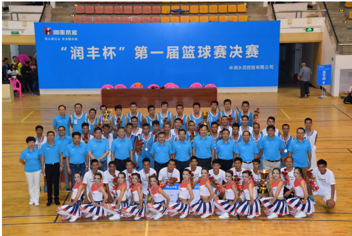
“润丰杯” 第一届篮球赛决赛 Final of the First "Runfeng Cup" Basketball Game