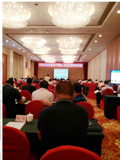
参加中国安全生产监督管理总局组织的央企安全管理培训班 Attend the Safety Management Training for Central State-owned Enterprises organized by State Administration of Work Safety of China