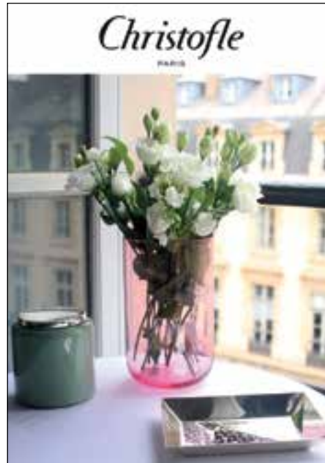
Christofle 'CONSTELLATION' collection homeware. 「Christofle」的「CONSTELLATION」系列家品。