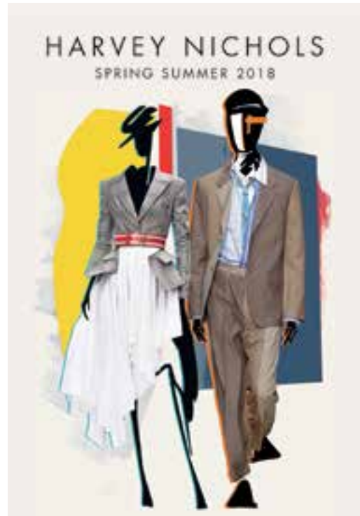
Spring / Summer 2018 fashion at Harvey Nichols. 於「Harvey Nichols」的二零一八年春/夏季時裝。

In terms of sales mix, fashion and accessories represented 37.3 per cent., watches and jewellery 31.1 per cent., cosmetics and beauty products 31.4 per cent. and securities trading 0.2 per cent..