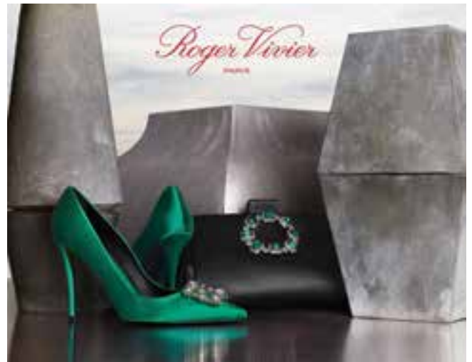
Handbag and shoes by Roger Vivier. 「Roger Vivier」手袋及鞋履。