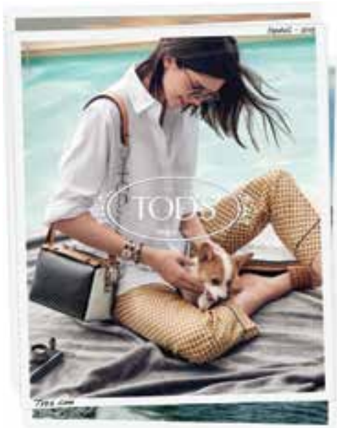
Handbag and shoes by Tod's. 「Tod's」手袋及鞋履。