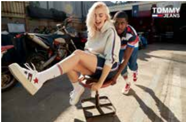
Fashionwear by Tommy Jeans. 「Tommy Jeans」時裝。

The Group continued to make additional direct investments in companies with high growth potential and did not dispose of any of its direct investments during the year. The Group made a net profit of HK$6.5 million from its investment portfolio.