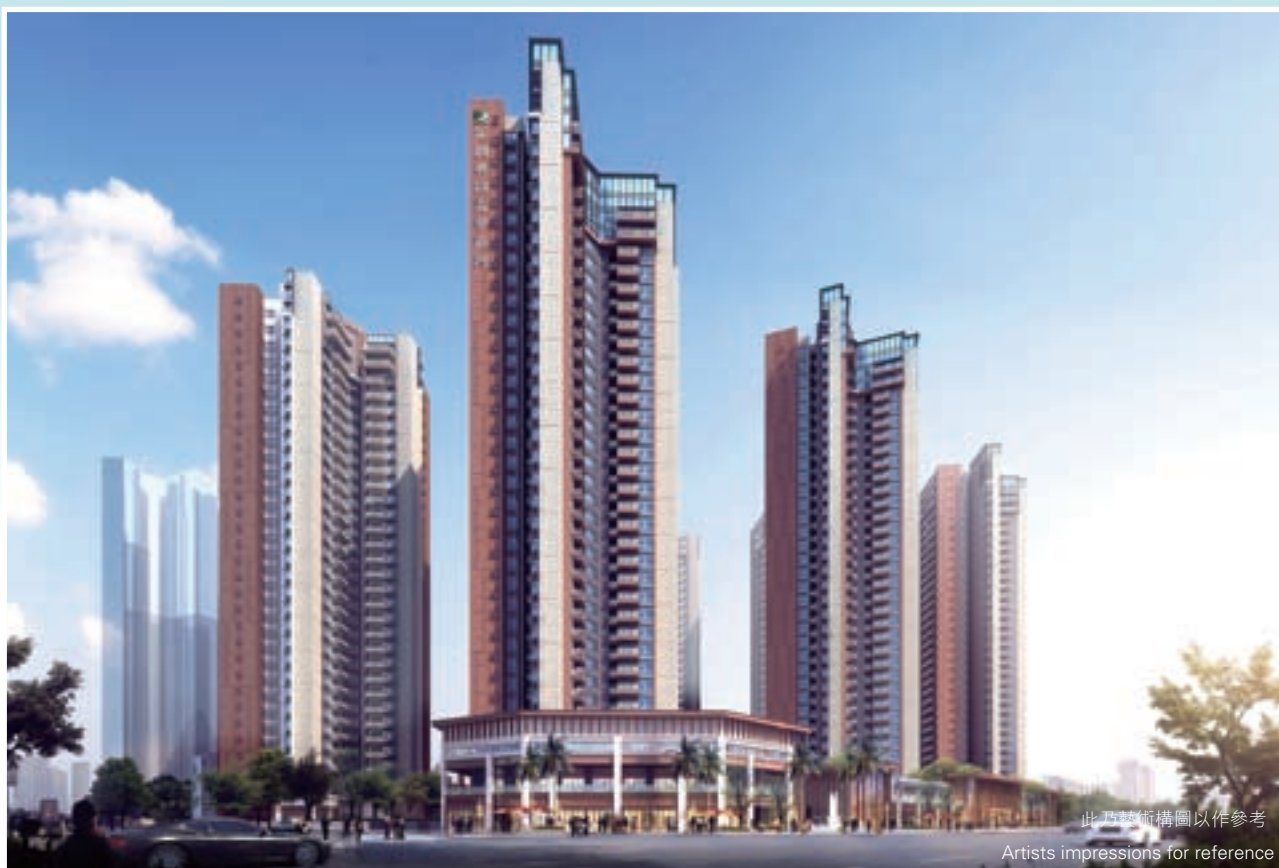
此為藝術構圖以作參考 Artists impressions for reference