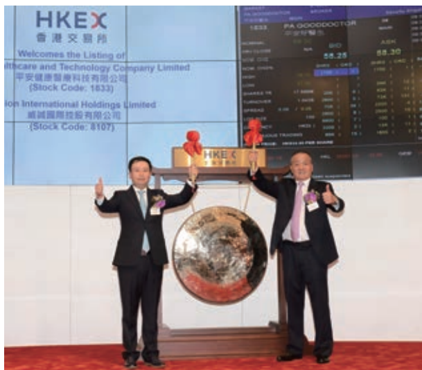
On May 4, 2018, Ping An Healthcare and Technology Co., Ltd. (Ping An Good Doctor, 01833.HK) was successfully listed on the HKEX.

This year marks the 40th anniversary of China’s reform and opening-up. Ping An’s success in the past 30 years is attributable to the opportunities from China’s reform and opening-up as well as the support from shareholders and customers. We launched the Three-Village