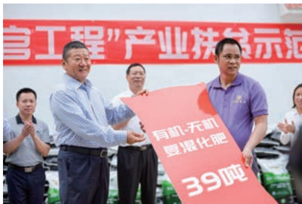
On May 22, 2018, Ping An began to implement the Three-Village Project in Guangxi to develop poor remote areas.

Project in answer to the state’s call to fight poverty. By means of technologies, we replicate smart city models in poor areas for “smart poverty alleviation”. In the first half of 2018, the Three-Village Project was implemented in four provinces and municipalities such as Guangxi.