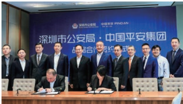
On April 27, 2018, Ping An signed a strategic partnership agreement with Shenzhen Public Security Bureau to develop "smart policing".

In the first half of 2018, we took the first step on our new-decade journey. Amid challenges in a dynamic and complex environment, we achieved remarkable results by furthering "finance + technology" and pursuing "finance + ecosystem" strategies. Ping An now ranks 29th in Fortune Global 500 and 10th in Forbes Global 2000.