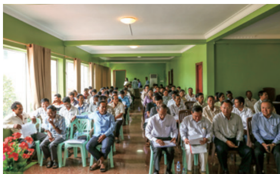
Dialogue Forum on Cassava Contract Farming in Kratie Province. 於桔井省舉行的有關木薯合約耕種的對話論壇。