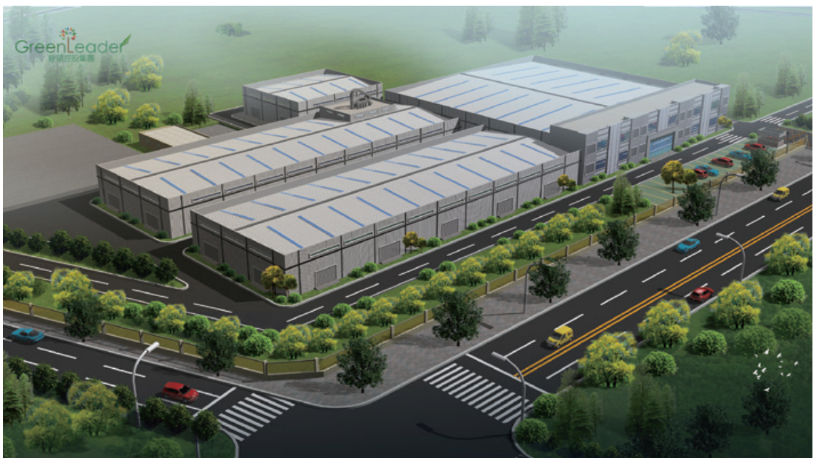
Design of processing plant 加工廠工程圖

截至二零一八年六月三十日止六個月，木薯澱粉業務並無產生任何收入（截至二零一七年六月三十日止六個月：69,833,000港元）。本集團於二零一六年底在柬埔寨開展木薯澱粉業務。為令本公司更清晰了解商業模式及經營慣例，本集團透過與多間柬埔寨公司合作，繼續拓展木薯澱粉業務。本集團進而向一名獨立供應商購買木薯作為原材料，並分包予一名獨立分包商以加工成澱粉。於二零一七年上半年，銷售經加工木薯澱粉予兩名獨立客戶產生收入約70,000,000港元。透過合作，本集團於