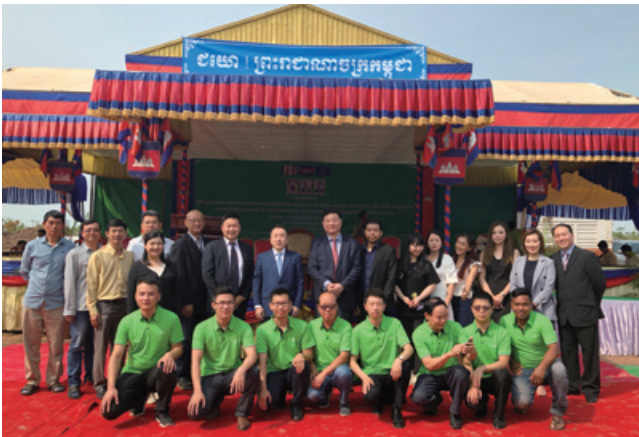
Groundbreaking and commencement of construction ceremony of the Group's first cassava starch processing plant in Cambodia in April 2018.

於回顧期內，本集團已於二零一八年四月為本集團在柬埔寨的首個木薯澱粉加工廠（「加工廠」）舉行奠基儀式及啟動工程建設。加工廠佔地面積約二十公頃，位於柬埔寨桔井省的西厝縣，距離金邊市約二百三十公里。加工廠投資約22,000,000美元，計劃於二零一八年底或之前落成並開始試產。在加工廠建成並開始生產後，本集團將可每年生產木薯澱粉及變性澱粉150,000噸。於二零一八年六月三十日，本集團成功種植2,500公頃木薯，並計劃由加工廠負責收割及加工為木薯澱粉。由於加工廠計劃於二零一八年底前開始試產，並自二零一九年一月正式投產，預期木薯業務於截至二零一八年十二月三十一日止年度不會產生重大收入。