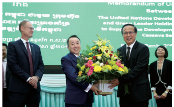
The Company and UNDP entered into a memorandum of understanding in April 2018. 本公司與聯合國開發計劃署於二零一八年四月訂立諒解備忘錄。