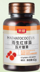
Hejian Haematococcus Pressed Candy 禾健雨生紅球藻壓片糖果