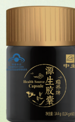
Ruiyang Yuansheng Capsule (Zhongsheng) 中生瑞養牌源生膠囊