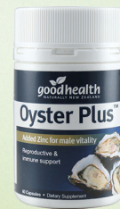
Oyster Plus Capsules 牡蠣精膠囊