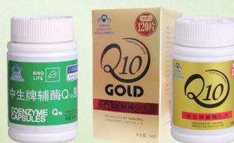
Coenzyme Q 10 Tablet/Capsules 輔酶Q 10 片/膠囊