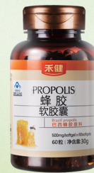
Hejian Propolis Softgel 禾健蜂膠軟膠囊