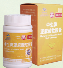
Linolenic Acid Soft Capsules 亞麻酸軟膠囊