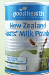
Goats' Milk Powder 山羊奶粉