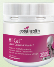
Hi Cal™ Liquid Calcium & Vitamin D 高鈣 — 液體鈣和維生素D