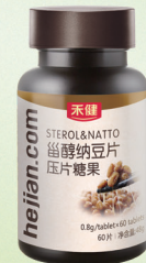
Hejian Sterol & Natto Pressed Candy 禾健甾醇納豆片壓片糖果