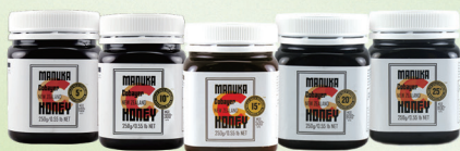
Manuka Honey 麥努卡蜂蜜