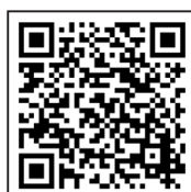
A Snapshot of 2018 Annual Report