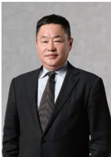
Far East Horizon Limited Chairman of the Board