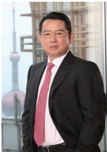
Far East Horizon Limited Vice Chairman of the Board and CEO