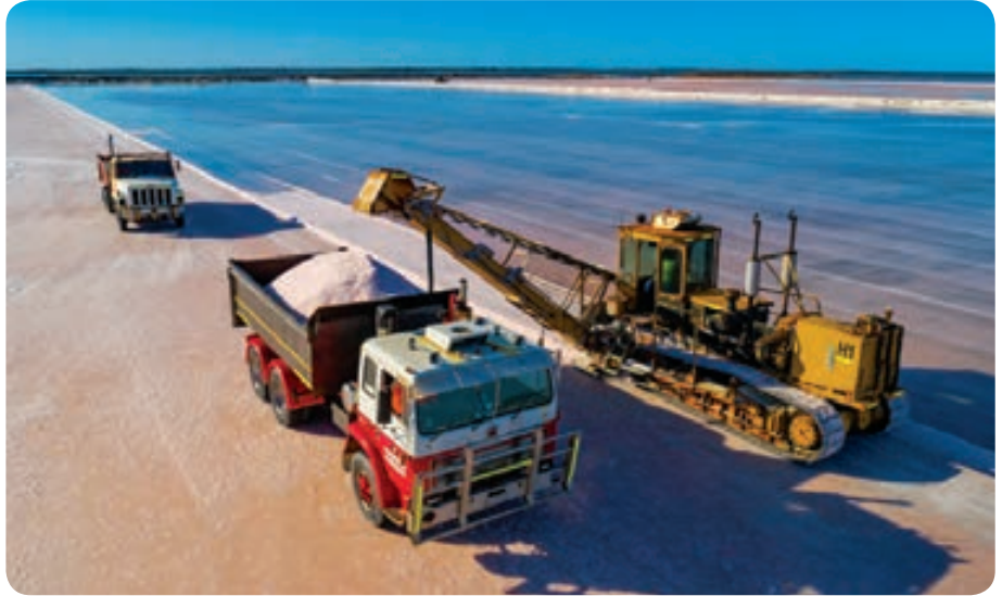
With a history dating back to 1888, Cheetham is Australasia's largest producer and refiner of salt.