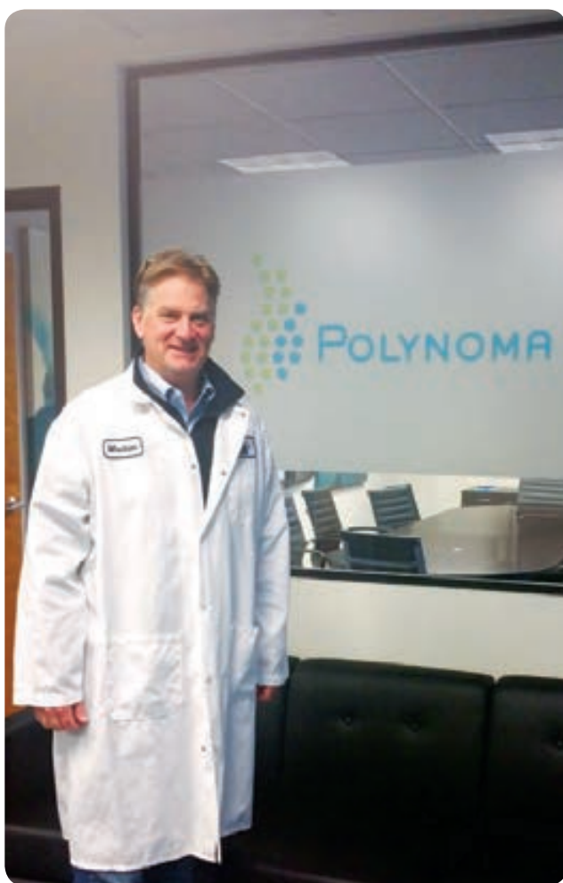
Polynoma is an oncology-focused subsidiary of CK Life Sciences which is currently developing a therapeutic vaccine for the treatment of melanoma.

Polynoma LLC ("Polynoma") is an oncology-focused, San Diego (USA)-based subsidiary of CK Life Sciences which is currently developing a therapeutic vaccine for the treatment of melanoma. Using a combination of antigens from three proprietary melanoma cell lines, Polynoma's vaccine (seviprotimut-L) is intended to stimulate the body's immune system to fight this form of skin cancer.