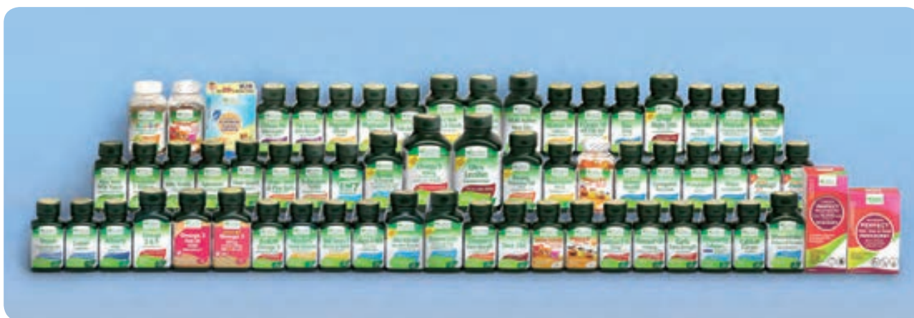
Offering a range of some 140 products under the Adrien Gagnon brand, Santé Naturelle is synonymous with exceptional quality.