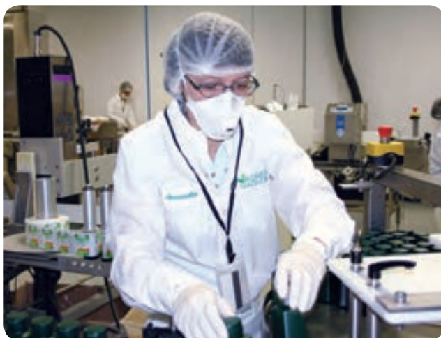
Santé Naturelle is one of the largest and most established natural health companies in Québec, Canada.

Outside Canada, Santé Naturelle exports to international markets, including Hong Kong and a number of Asian and Middle Eastern countries. Continuing expansion into new channels and markets is a focus of the team. New initiatives to gain a foothold in selected European markets and parts of the United States will come to fruition in the next few years. It also upgraded its enterprise software system and developed plans to expand in-house manufacturing, both enablers of operating efficiency improvement and cost reduction.