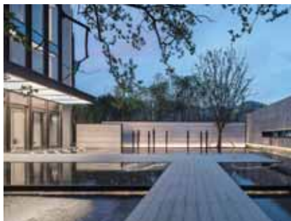
寧波旭輝鉅府 Ningbo CIFI Central Mansion