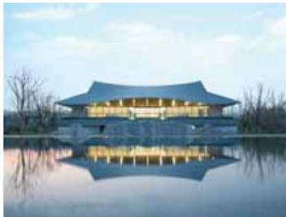
蘇州吳中區西山項目 Suzhou Wuzhong District West Mountain Project