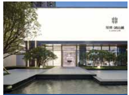
南寧旭輝湖山麓 Nanning CIFI Landscape