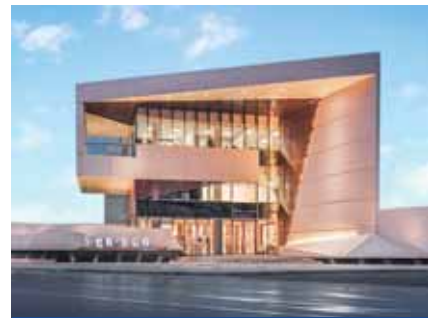
瀋陽旭輝錦宸府 Shenyang CIFI Bochen Mansion