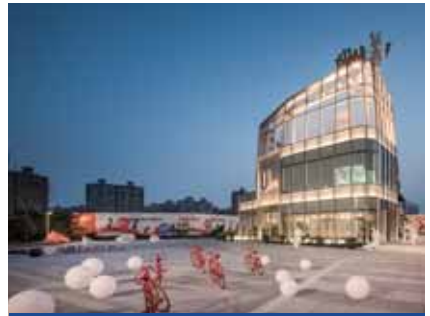
上海寶山區羅店鎮項目 Shanghai Baoshan District Luodian Town Project