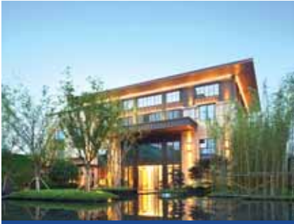
南京旭輝錦悅秦淮 Nanjing CIFI Park Mansion Qinhuai