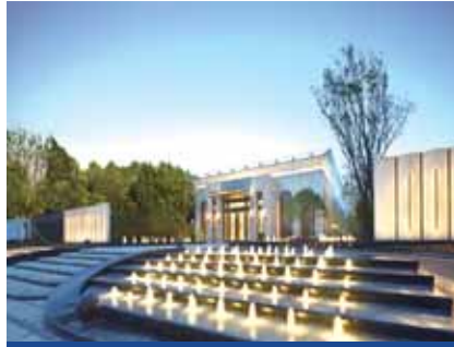
南京北辰旭輝錦悅金陵 Nanjing North Star CIFI Park Mansion Jinling