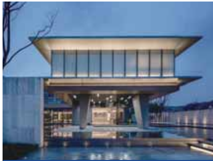
杭州旭輝濱江東方悅府 Hangzhou CIFI Binjiang East Mansion