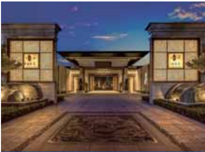
濟陽旭輝雍禾府 Shenyang CIFI Luxury Mansion