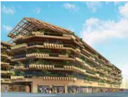
上海黃浦區馬當路項目 Shanghai Huangpu District Madang Road Project