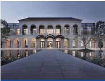
長沙旭輝湖山賦 Changsha CIFI Hushan Mansion