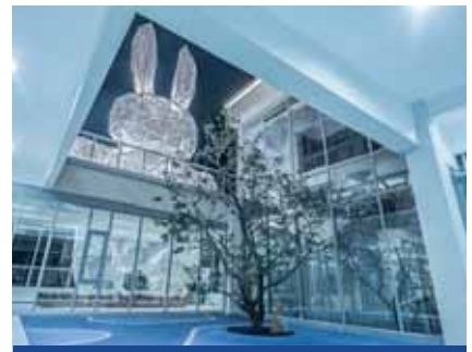
佛山旭輝長樂府 Foshan CIFI Changle Mansion