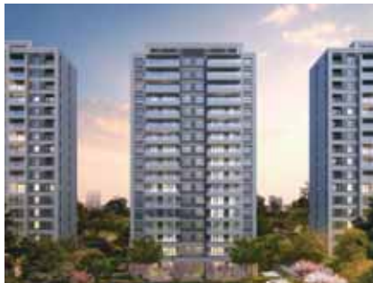
溫州旭輝臨海之光 Wenzhou CIFI Future City