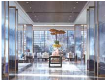
天津旭輝6號院 Tianjin CIFI No.6 Courtyard