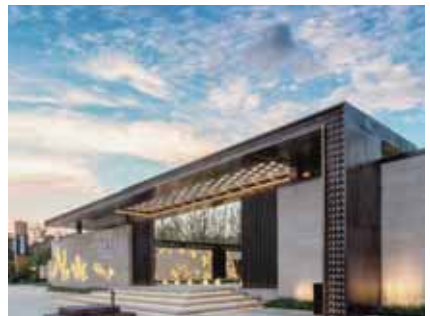
宜興恒基旭輝府 Yixing Henderson CIFI Mansion