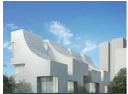
北京七里莊項目 Beijing Qilizhuang Project