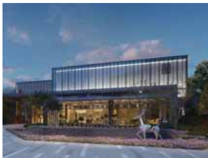
杭州旭輝和昌都會山 Hangzhou CIFI Hechang Metropolis Mansion