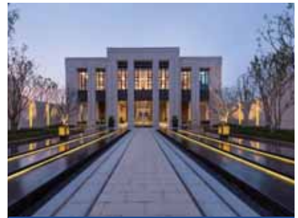
合肥旭輝公元天下 Hefei CIFI Lake Mansion