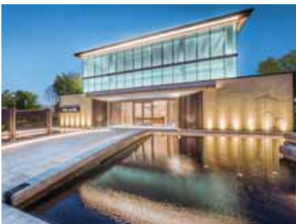
寧波旭輝江山賦 Ningbo CIFI Jiangshan Mansion