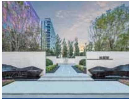
北京旭輝城 Beijing CIFI City