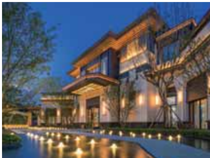
成都華宇旭輝錦繡花城 Chengdu Huayu CIFI Glorious Flower City