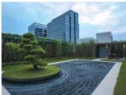
上海閔行區莘莊項目 Shanghai Minhang District Xinzhuang Project