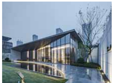
南通港閘項目 Nantong Gangzha Project