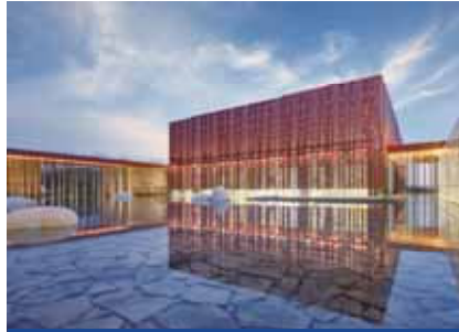
重慶旭輝御璟湖山 Chongqing CIFI Glory Land