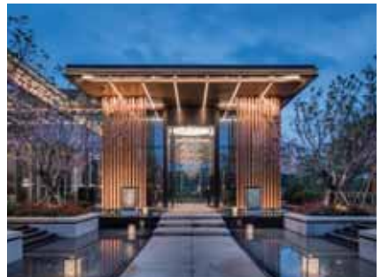
武漢鉅龍旭輝半島 Wuhan Yulong CIFI Peninsula