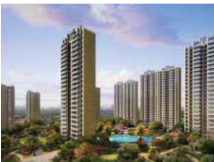
溫州碧桂園旭輝湖悅天境 Wenzhou Country Garden CIFI Lake Mansion