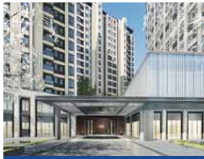
長沙旭輝南宸府 Changsha CIFI Nanchen Mansion