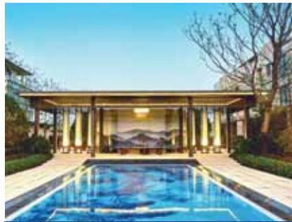
合肥旭輝錦璟江山 Hefei CIFI Glory Land