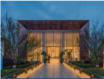
合肥旭輝江山印 Hefei CIFI Jade Seal