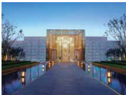
鄭州旭輝正榮首府 Zhengzhou CIFI Grand Mansion