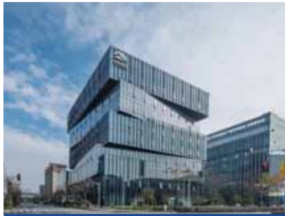
上海恒基旭輝中心 Shanghai Henderson CIFI Center