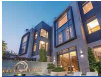
香港春坎角項目 Hong Kong Chung Hom Kok Project