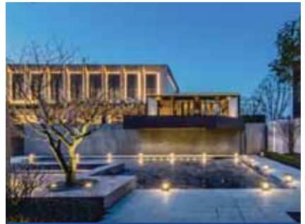
杭州旭輝東原東越府 Hangzhou CIFI Dongyuan Majestic Mansion