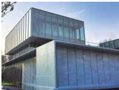
無錫旭輝藏龍府 Wuxi CIFI Cang Long Mansion