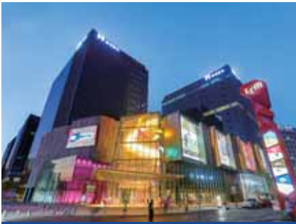
上海LCM項目 Shanghai LCM Project