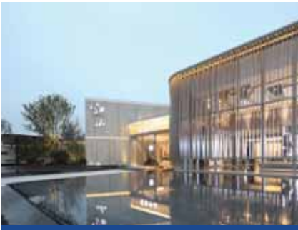
佛山旭輝江山 Foshan CIFI Homeland