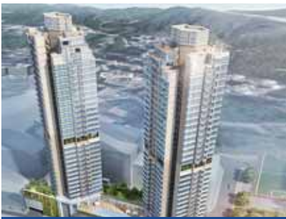
香港油塘四山街項目 Hong Kong Yau Tong Sze Shan Street Project