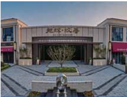
合肥旭輝玖著 Hefei CIFI Jiuzhu Mansion