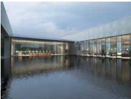
常州旭輝銷悅天寧 Changzhou CIFI Park Mansion