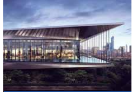
重慶旭輝印江州 Chongqing CIFI Jiangzhou Impression