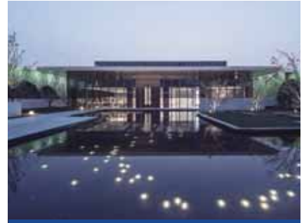
徐州旭輝江山御 Xuzhou CIFI Noble Mansion