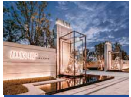
泉州石獅旭輝城 Quanzhou Shishi CIFI City