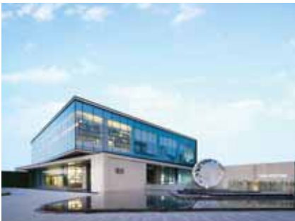
成都旭輝金科棠府 Chengdu CIFI Jinke Tang Mansion