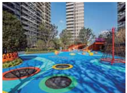
蘇州旭輝銷悅犀湖 Suzhou CIFI Lake Mansion