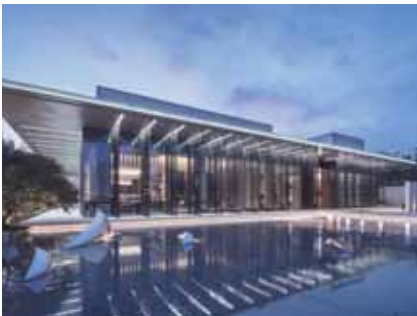
蘇州綠地旭輝吳門府 Suzhou Greenland CIFI Wujiang Mansion