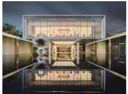
南京旭輝鉅悅源墅 Nanjing CIFI Park Mansion Yuan