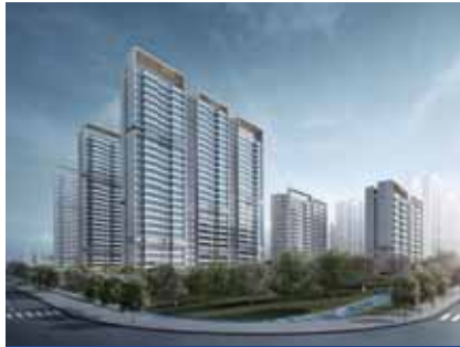
濟南旭輝鎔悅鳳犀台 Jinan CIFI Park Mansion Fengxi