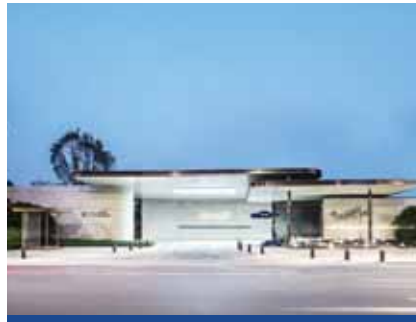
佛山旭輝公元 Foshan CIFI New Century