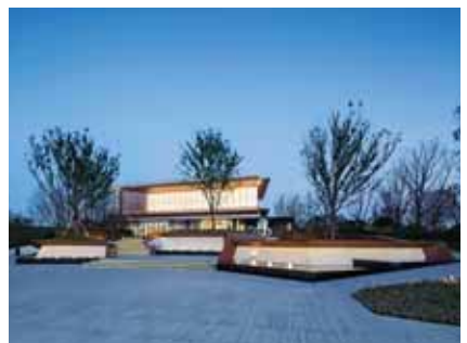
寧波上湖城 Ningbo Prosperous Reflection