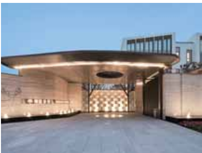
杭州旭輝朗香郡 Hangzhou CIFI Ronchamp County