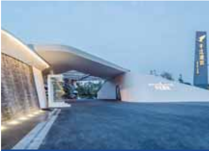
重慶旭輝千江凌雲 Chongqing CIFI Waves River