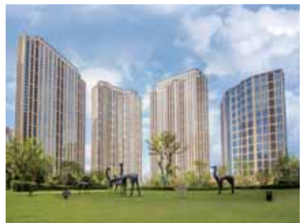
杭州綠地旭輝城 Hangzhou Greenland CIFI Glorious City