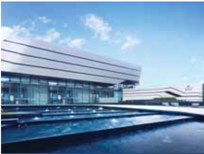
杭州旭輝東原國濱府 Hangzhou CIFI Dongyuan Guobin Mansion