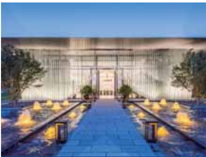
天津旭輝天悅風華 Tianjin CIFI Tianyuefenghua