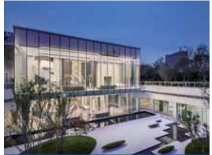
青島旭輝銀盛泰正陽府 Qingdao CIFI Yinshengtai Zhengyang Mansion