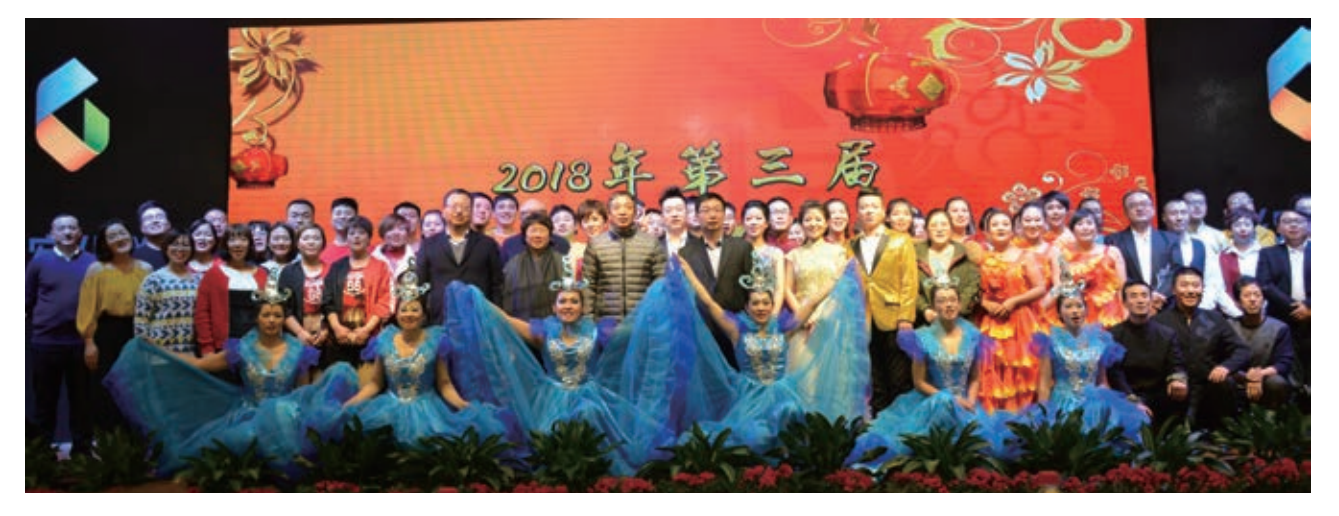
Employees arranged their own performances and participated the 3rd Annual Literary Show for cultural exchange 員工參加第三屆文藝匯演,自行編排表演作文化交流