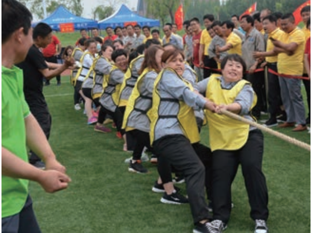
Employees participated the 13th Annual Sport day 員工參與第十三屆運動會

Attributing to the participation of the employees and the cooperation between different departments, the Group has created a corporate culture that focuses on the wellness of our employees and treats the factory as their home through various activities.