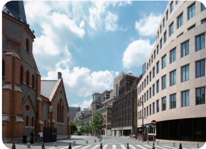
Yuanmingyuan Road, Rockbund, Shanghai

Against this backdrop and macro environment, Sinolink has been exploring new growth approaches to capture potential opportunities arising from the new form of economic development, while seeking opportunities and launching initiatives for investing and participating in financial technology and new economy sectors and striving for greater room to expand its operations in pursuit of sustainable development and stable return.