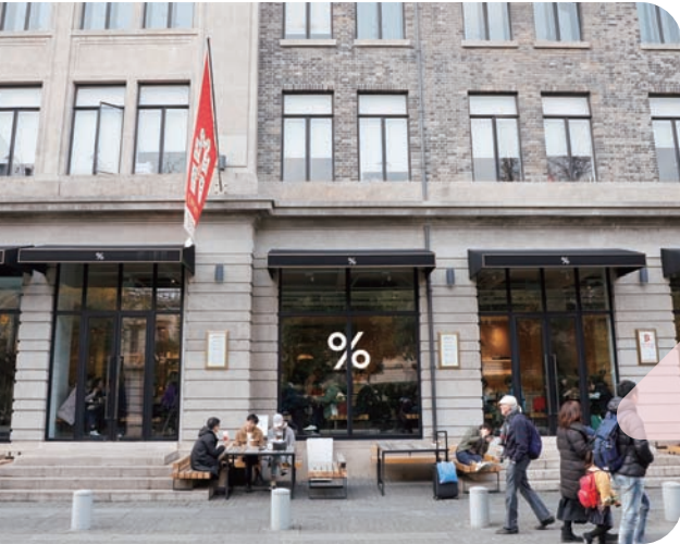
Associate Mission Building, Rockbund, Shanghai