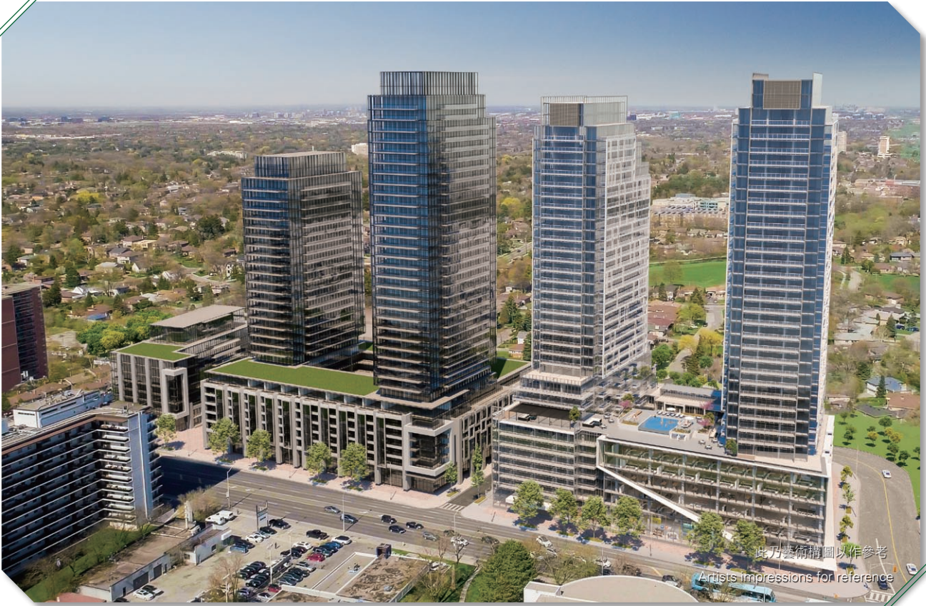
此乃藝術構圖以作參考 Artists impressions for reference