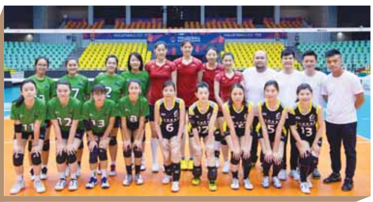
Players of the Chinese national team, Macau junior volleyball players, and members of the GEG Staff Social Club Volleyball Team played a mixed friendly match on the eve of the "FIVB Women's Volleyball Nations League – Macau 2019" tournament.