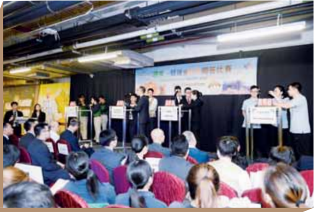
To deepen team members' awareness of environment, health and safety concepts, GEG organized the 5th annual "GEG Environmental, Health and Safety Quiz Competition".