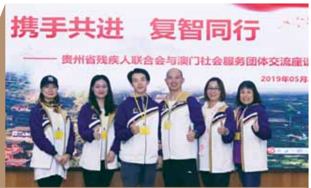
In May, several GEG Volunteers joined the Association of Parents of the People with Intellectual Disabilities for a 5-day volunteering trip to Guizhou during which they visited the local government, rehabilitation association and disadvantaged families to learn about the hardships faced by local people seeking education, rehabilitation and support for persons with intellectual disabilities.