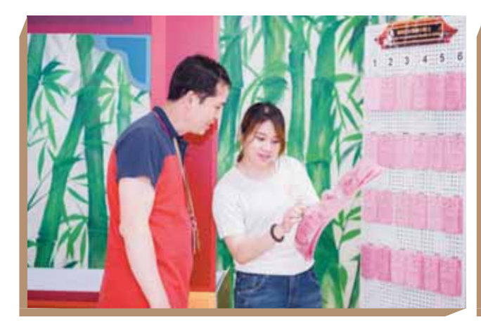
To promote team members' occupational safety awareness, GEG organized the "GEG Occupational Health and Safety Roadshow" in the back-of-house areas of its properties. During the roadshow, designated staff were arranged to explain safety tips to team members.

Recognizing the importance of responsible waste management, GEG has a comprehensive recycling program in place at all its properties. In the first half of 2019, GEG collected approximately 17,156 kg of food waste for composite or fish feed making, as well as collected approximately 531 tons of cardboard and paper materials, 63 tons of plastic, 22 tons of metals, 79 tons of glass bottles, 32 tons of waste oil and 0.74 ton of printer cartilages for recycling.