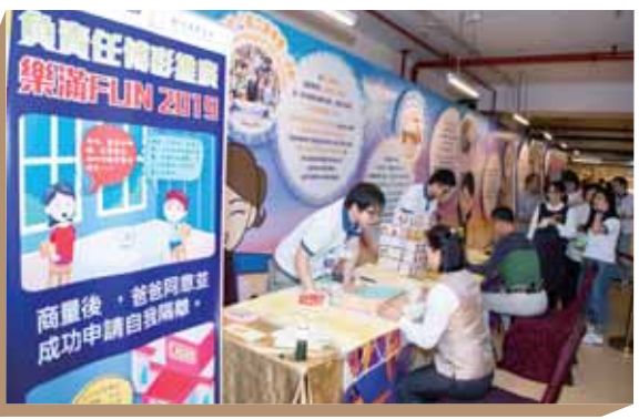
GEG launched a range of responsible gaming promotional activities with local non-governmental associations to introduce the importance of rational gambling with interactive games.