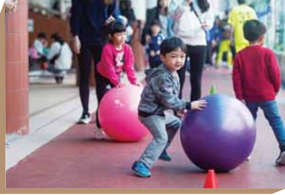
To promote work-life balance, friendship and family bonding, GEG hosted the 6th annual "Chinese New Year Soccer Fun Day" for 300 team members and their family members to attend. This year, the event included a soccer carnival, family-friendly game booths, snack stations and polaroid photo booths for participants to enjoy.