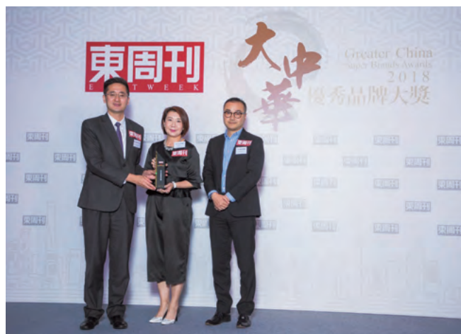
Greater China Super Brands Awards 2018, East Week 東周刊大中華優秀品牌大獎2018