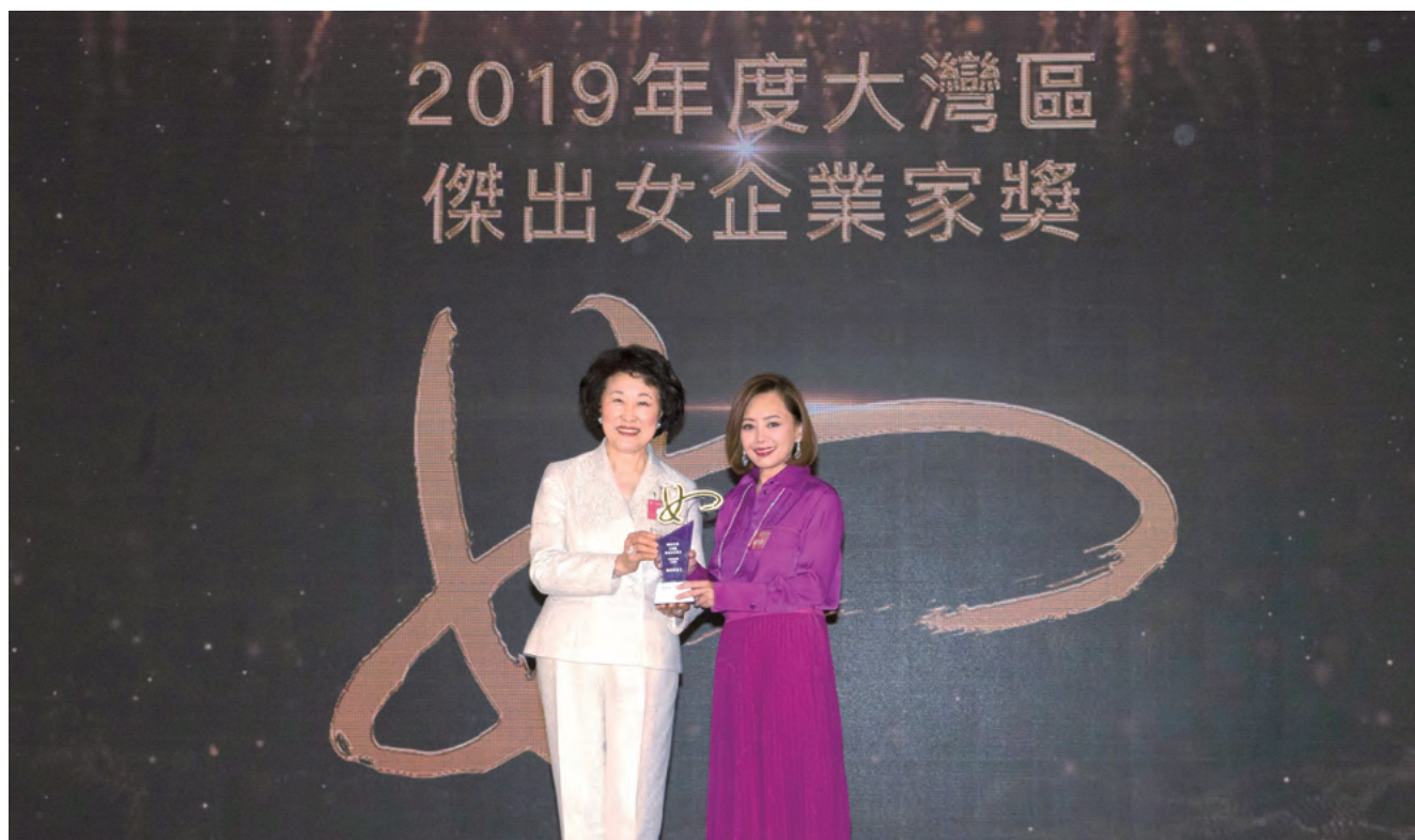
GBA Outstanding Women Entrepreneur Awards 2019 2019年度大灣區傑出女企業家獎

人民幣貶值及境外資本流動的控制加強降低了內地投資者對外投資的意欲。尤其是自2019年6月，不間斷的社會不穩運動導致本地物業市場及其他行業的投資意欲低迷，拖累中國香港及中國內地經濟，並進一步阻嚇投資者。由於地區及全球前景不明朗，中國香港金融市場非常動盪。於本年度，恒生指數下跌超過6%，於2019年9月30日收報26,092點。