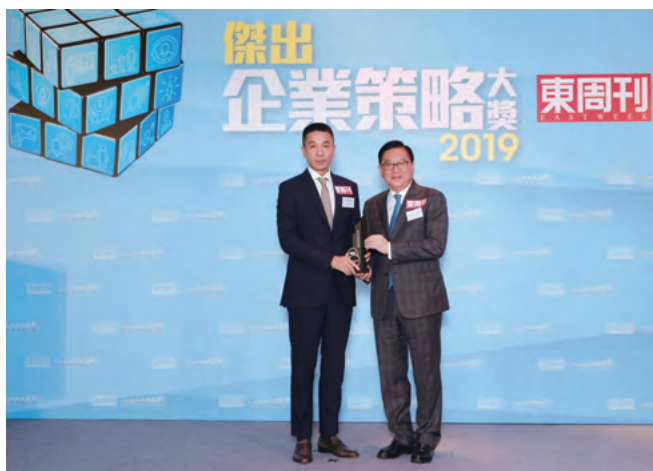
Outstanding Corporate Strategy Awards 2019, East Week 東周刊傑出企業策略大獎2019

於本年度，由於全球金融市場動盪及不利的營商環境，本集團已作出重大努力以加強其風險管理並強化其資本管理。本集團已實施更嚴格的貸款審批程序，並於適當時候調整利息費用以及貸款對估值比率。就本年度產生的重大減值撥備金額，相關法律訴訟已展開。