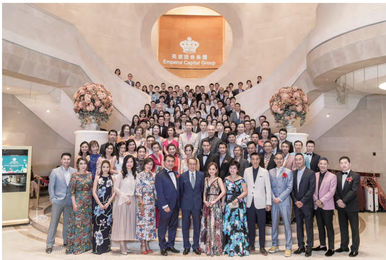
ECG 12th Listing Anniversary Dinner 英皇證券集團上市12周年晚宴

過去十年間，本集團已成功轉型為以利息收入為本的金融機構，並使收入來源多元化。本集團的主要優勢在於其健全的業務模式及多元化的業務，能抵禦日益複雜的市場環境。本集團目前在中國香港經營四間分行，並在中國內地設有三間聯絡辦事處。