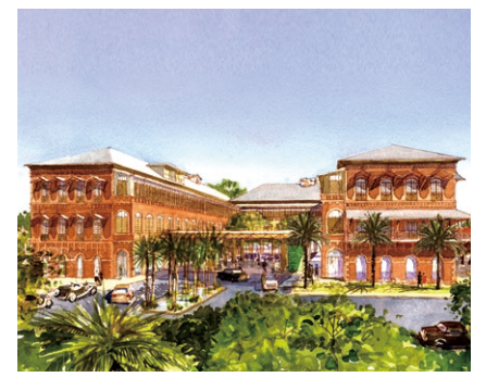
The Peninsula Yangon Ownership: 70%