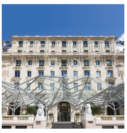
The Peninsula Paris Established: 2014