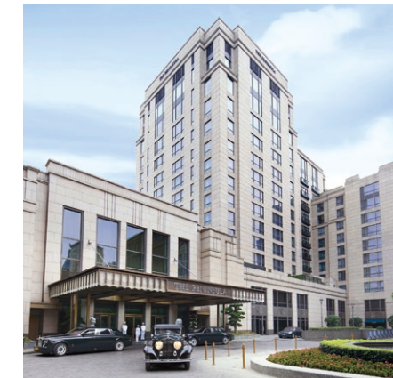
The Peninsula Shanghai Established: 2009