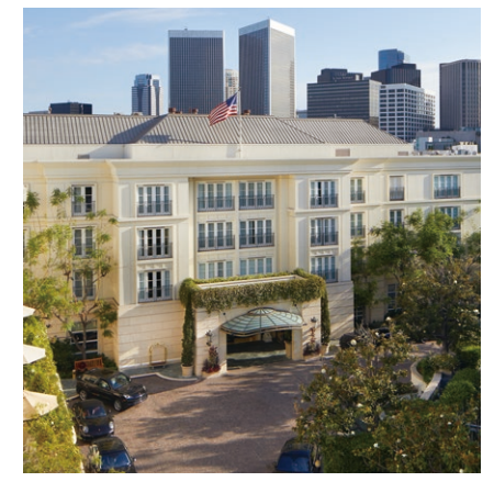
The Peninsula Beverly Hills Established: 1991