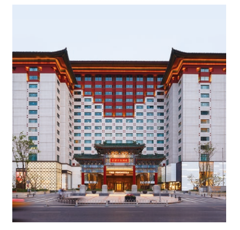
The Peninsula Beijing Acquired: 1989 Rooms: 230 Ownership: 76.6%