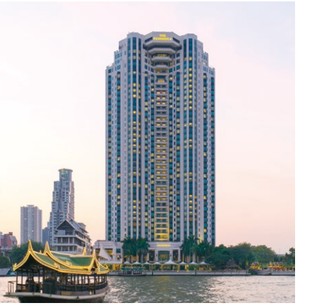
The Peninsula Bangkok Established: 1998