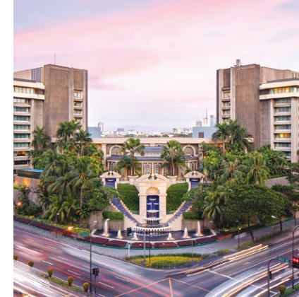
The Peninsula Manila Established: 1976 Rooms: 351 Ownership: 77.4%