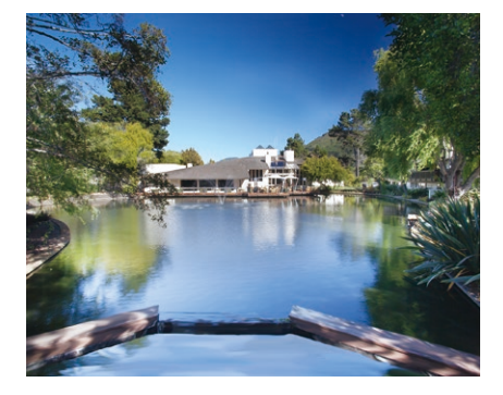
Quail Lodge & Golf Club Carmel, USA Acquired: 1997