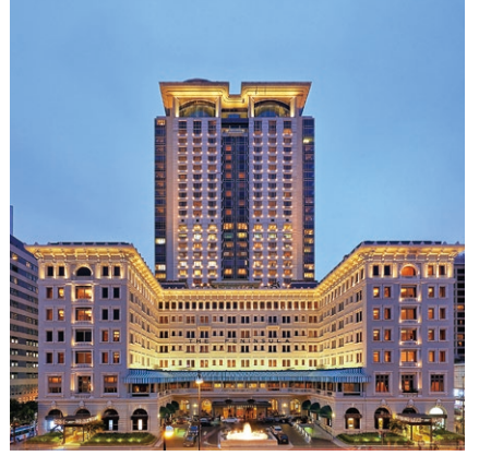
The Peninsula Hong Kong Established: 1928