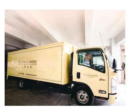
Tai Pan Laundry Hong Kong Established: 1980