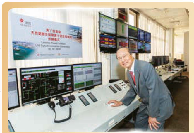
L10, the new gas-fired generating unit, achieves two key milestones of “First Firing” and “Synchronisation” during the year for commissioning in February 2020.