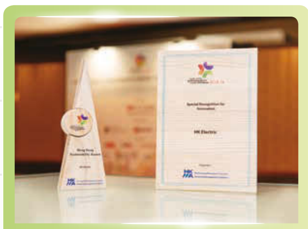
The Hong Kong Management Association presents us with the “2018/19 Hong Kong Sustainability Award” and “Special Recognition for Innovation” in recognition of our commitment to these two facets of operations.