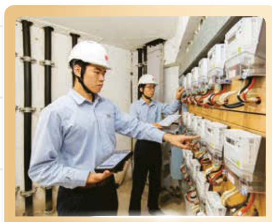
A pilot project for smart meters with Advanced Metering Infrastructure (AMI) is successfully implemented. A contract for mass deployment of smart meters commencing from 2020 is awarded after a tendering process.