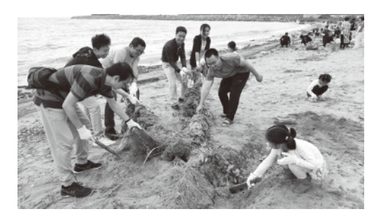
Cleaning up Marine Garbage

In 2019, Kingsoft held public welfare activities for environmental protection, organising staff to hiking in natural area and protect nature. Beijing Office Software organised staff in Zhuhai and their families to participate in community-organised activities to clean up marine garbage, with a total of 85 kilograms of marine garbage being cleaned up.