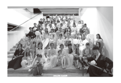
Han Chinese Costume Day of Seasun Holdings