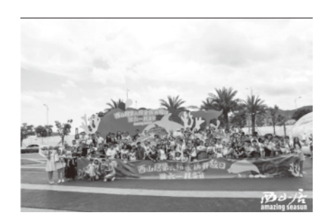
The 6<sup>th</sup> Family Day of Seasun Holdings