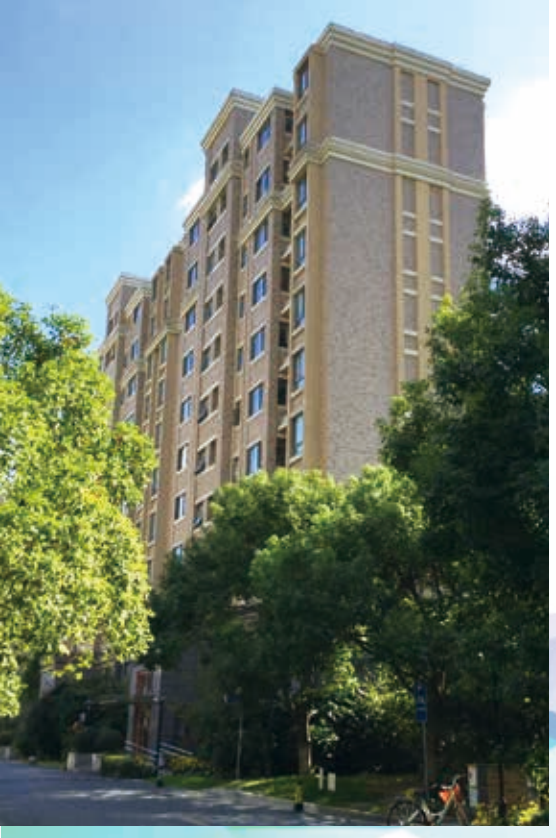
Zhangjiang Tomson Garden 張江湯臣豪園