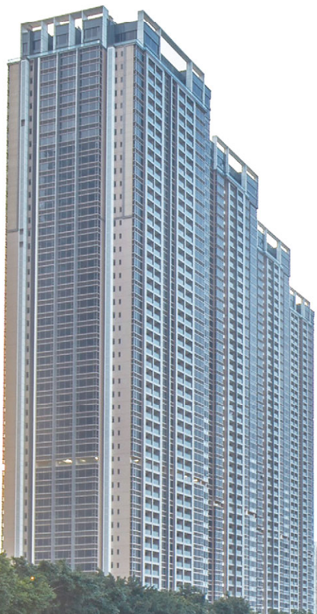
La Marina (Macau)