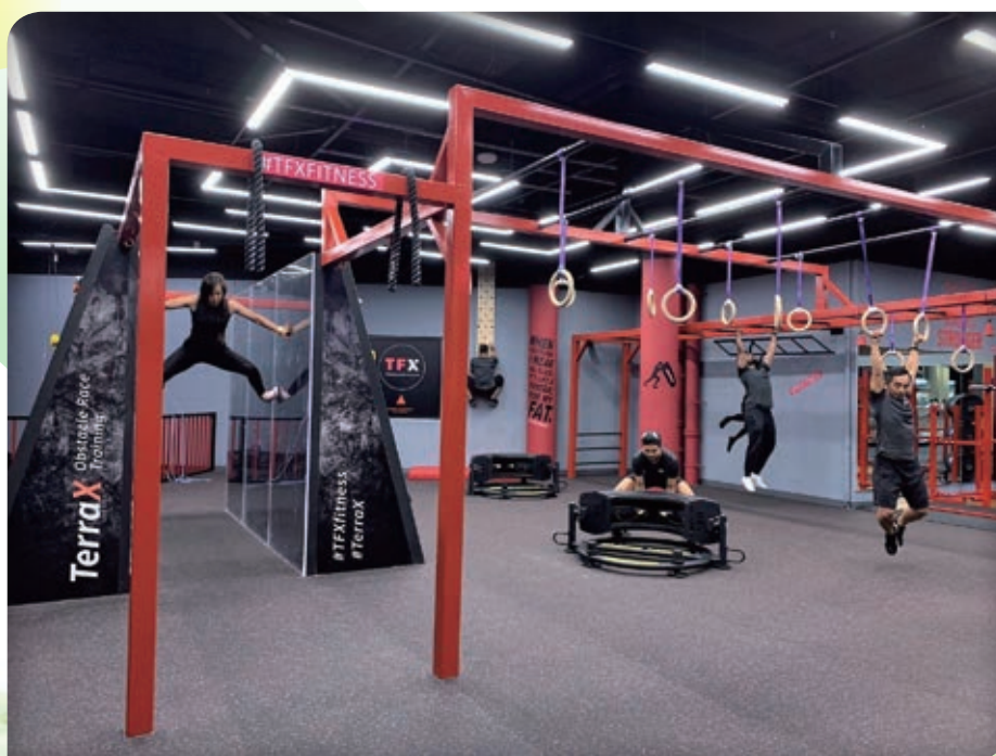
TFX健身中心 TFX fitness centre

We also departed from the age-old practice of fitting out the clubs with the bulk of equipment from a single brand as we believed that despite the outstanding quality of the equipment of certain brands, they are not necessarily the best in everything. The new management team is passionate about fitness, and we went about hand-picking the best pieces from different brands to provide a truly curated fitness facility for our members. TFX has equipment from specialized brands that one typically sees in “CrossFit” boxes, strongman gyms, boxing gyms and calisthenics studios.