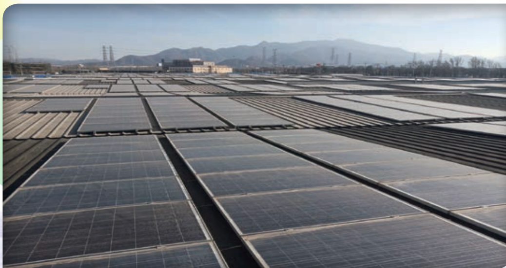
北京的太陽能發電項目 The Solar Energy Generation Project in Beijing