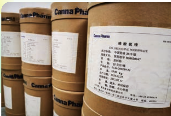
重慶康樂生產之原料藥磷酸氯喹 API Chloroquine Phosphate manufactured by Chongqing Kangle

區) in Chongqing, it is subject to relatively stringent regulation by the environmental protection, safety and other departments. In addition, due to its foreign certifications such as Current Good Manufacturing Practices ("cGMP") and the World Health Organization ("WHO"), Chongqing Kangle is also subject to frequent examination, verification and audit procedures in a year, which, to a certain extent, will affect its production schedule. However, with extensive experience accumulated over the years in dealing with the above situation and minimizing the relevant impact, in 2020, Chongqing Kangle will continue to devote to research and development, introduction of new products, construction of ancillary facilities, environmental protection as well as safety to ensure its rapid growth in the future.