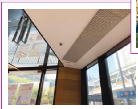
Get Nice Centre, Hung Hom 紅磡 - 結好中心