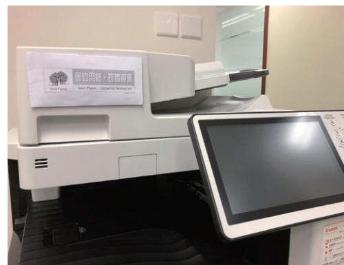
Notice of Printing and photocopying control for paper saving. 張貼列印及影印管制通知以節約用紙。