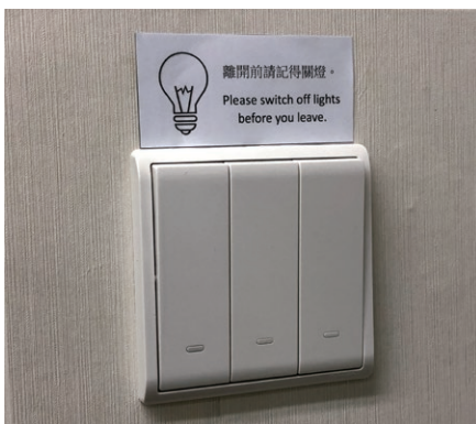
Energy saving signs remind staff members to turn off the lights after using in order to promote energy conservation. 張貼節能標誌提醒員工用後關燈以推動節能。