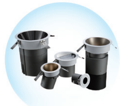
Hotel Downlight Series 酒店筒燈系列