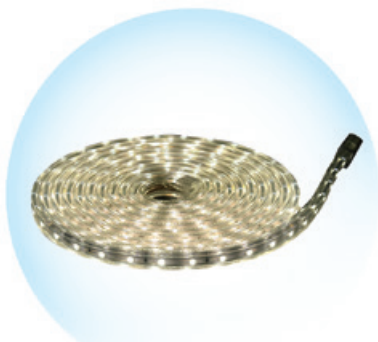
Strip Light 燈帶