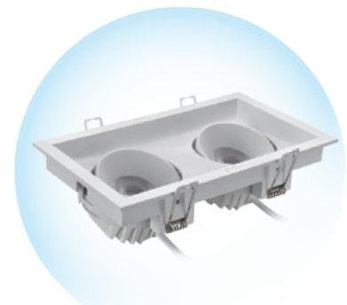
Multiple Light Series 格柵射燈系列