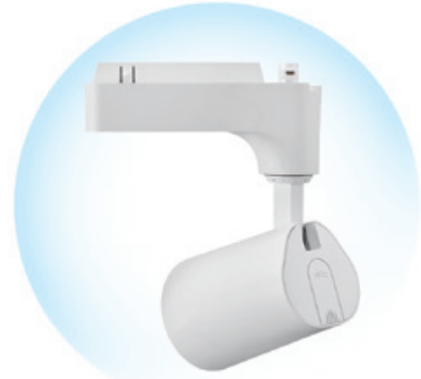
Track Light Series 導軌射燈系列