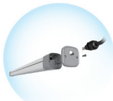
Vaportight Series 三防燈系列