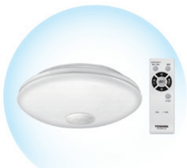
LED Bluetooth Speaker Ceiling LED 藍牙音響吸頂燈