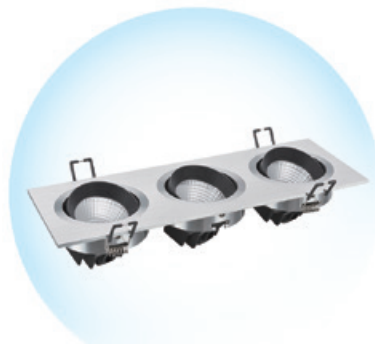
Multiple Light Series 格柵射燈系列