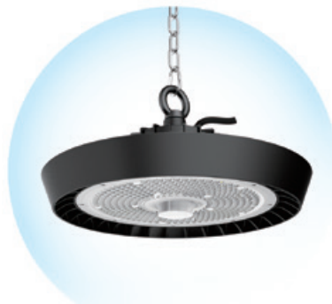
Highbay Light Series 天棚燈系列