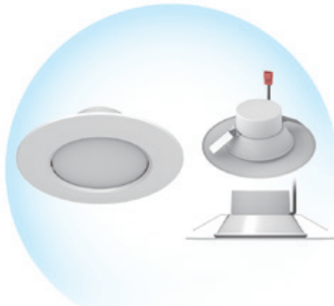
Smart Downlight Series 智能筒燈系列