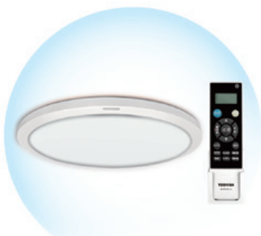
LED Panel Ceiling LED 導光板吸頂燈