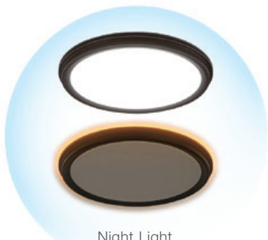
Night Light Flushmount Series 小夜燈超薄吸頂燈系列