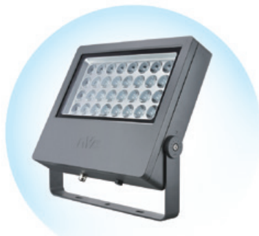
Flood Light Series 投光燈系列