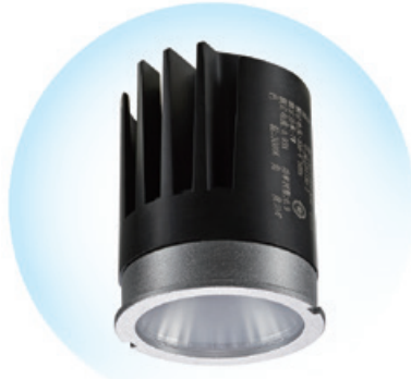
Spotlight Series 天花燈系列