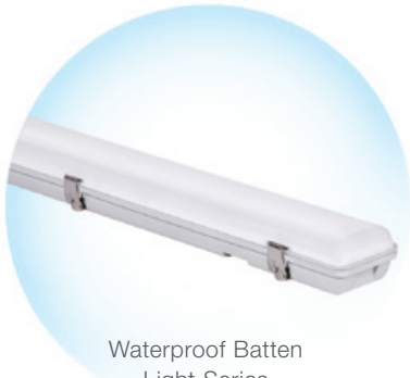
Waterproof Batten Light Series 三防支架系列