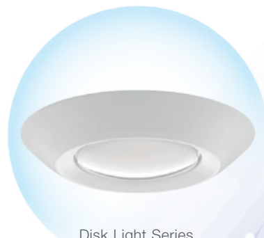
Disk Light Series 吸頂、嵌入兩用 吸頂燈系列