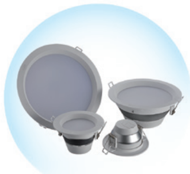
Downlight Series 筒燈系列