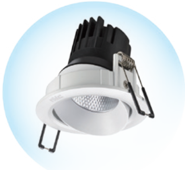
Spotlight Series 天花燈系列