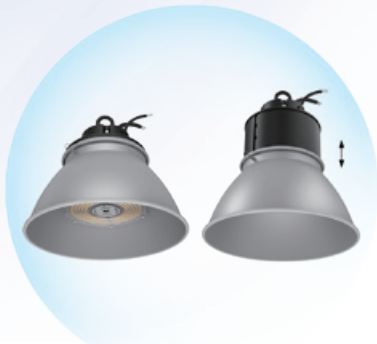
High Bay Series 高棚燈系列