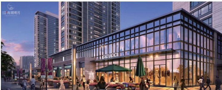
Nan Hu Ming Yue 南湖明月

鑒於不斷變化的市場狀況，於回顧期內，本集團積極調整策略，抓住機遇，果斷出擊，在土地市場上持續發力，通過公開市場競買、合作開發等多種方式，新增了12幅土地，較去年同期增長逾一倍。不僅鞏固了杭州、寧波、麗水等城市核心區域的市場地位，也完成了溫州、紹興、台州和舟山等浙江省內重點地市的布點。為本集團規模上台階奠定了堅實的基礎。銷售方面，本集團因應疫情及時調整和部署運營和銷售策略，克服多重困難，經濟重啟後快速恢復正常銷售，2020年上半年合約銷售再創佳績。企業治理層面，本集團管理層審時度勢，結合企