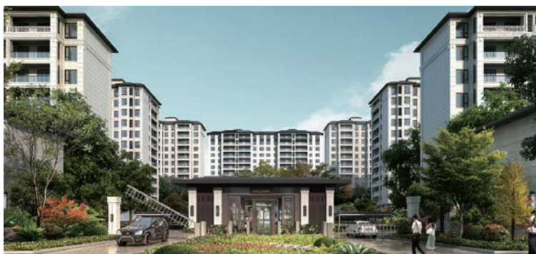
Comphor Tree Bay 香樹灣

截至2020年6月30日止六個月期間的回顧期內利潤約為人民幣319.5百萬元(2019年同期：約人民幣624.7百萬元)，下降約48.9%。下降原因主要為於本期交付項目較去年同期有所減少。於回顧期內歸屬於母公司利潤約為人民幣308.0百萬元(2019年同期：約人民幣333.1百萬元)。