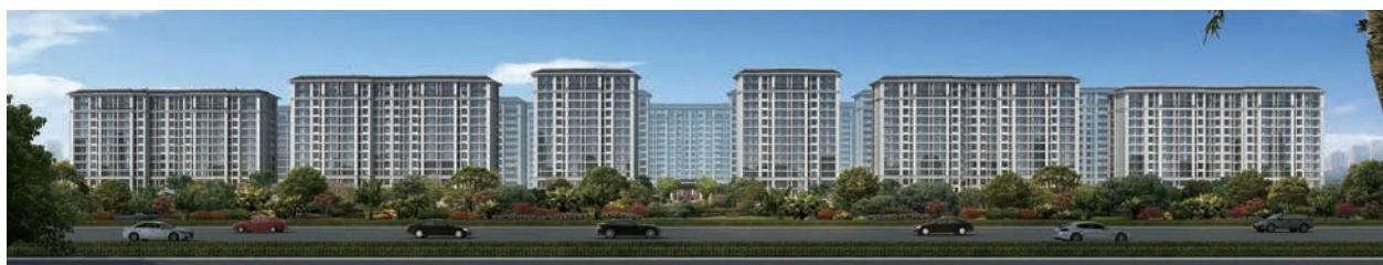
Typha Lotus Garden 蒲荷花苑

物業租賃產生的收入約為人民幣82.4百萬元(2019年同期：約人民幣82.4百萬元)。本集團酒店營運錄得收入約為人民幣63.9百萬元(2019年同期：約人民幣60.1百萬元)，上漲約6.3%。本集團物業管理服務產生的收入約為人民幣119.6百萬元(2019年同期：約人民幣99.6百萬元)，上漲約20.1%。