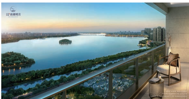
Nan Hu Ming Yue 南湖明月

2020年，對於眾安來說，是一個推進五年戰略目標的關鍵之年，機遇與挑戰並存。面對日趨嚴峻的國內外環境，本集團將繼續走健康發展之路，抓住機遇，逆勢而上，努力做好各環節的風險管控。不懼困難，不忘初心，堅持朝著既定的目標和夢想前進，將規模做大做強。在穩健發展的同時，本集團仍將繼續創新的步伐，積極拓展多元化產業發展方向，並充分發揮中國新城市多元化產業發展的優勢，尋求更多的發展機會。同時，本集團將進一步加強新產品打造，進一步提升產品服務質量，提高整體經營能力。在未來發展的徵途中，本集團仍將沿著可持續發展、健康發展的道路，堅持科技創新，不斷優化產業結構，挖掘新的產業機會，發揚新的企業優勢，始終堅持做健康企業的發展經營理念，為區域經濟發展做貢獻。