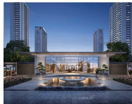
Nan Hu Ming Yue 南湖明月