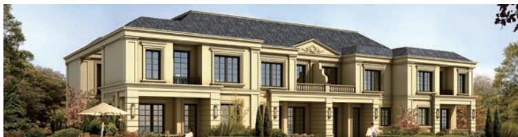
Chaoyang No. 8 朝陽8號

During the period under review, the Group continued to rank Top 100 Property Service Companies in China. Its property management fee income increased about 2% as compared with that of the same period in 2019, which continued to provide the stable cash flow for the Group. The Group will continue to actively develop new projects to further improve the quality of property services.