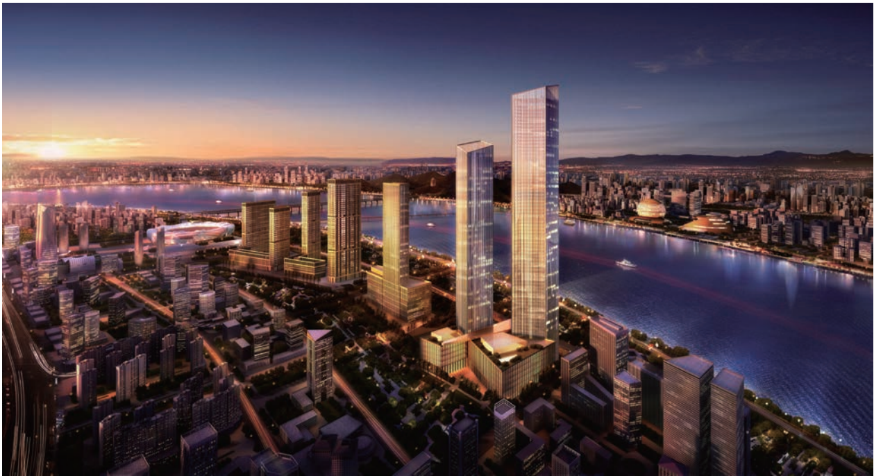
International Office Centre 國際辦公中心