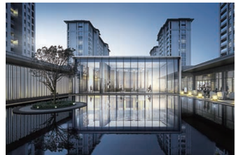
Typha Lotus Garden 蒲荷花苑