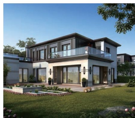
Jade Mansion 翡翠瓏灣