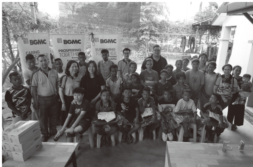
Visit to Promise Home on 30 December 2019

The Group organised charity visitation on 30 December 2019, employees of the Group visited the Promise Home, a shelter in Kota Kemuning, Shah Alam for underprivileged Orang Asli children, bringing the “back to school” needs which consists of uniforms, stationeries, shoes, consumable dry foods and dinner to the residents.