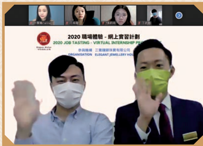
The Group held two introduction seminars on the watch retail industry for students who were about to graduate and go to society online instead.

回顧年度內，三寶公司通過「學校起動計劃」面試挑選了三位年滿16週歲的學生，原本按計劃擬定於7月暑假到集團零售門店開展為期兩週的門店實習，學習招待客人、零售買賣等日常前線工作，為即將畢業的學生提供真實的職場環境，助其更好地走向社會。因為疫情的關係，實習活動被迫取消，最終改為於8月中以網絡形式舉辦了兩場鐘錶零售行業簡介講座，令參與的學生對鐘錶零售行業的日常運營及工作範疇有了大致的了解。