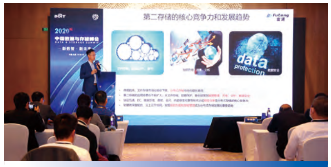
The Group participated in different conferences and forums