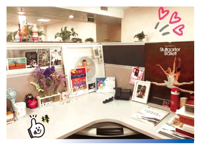
Futong 2020 "The Best Office Seat Competition"