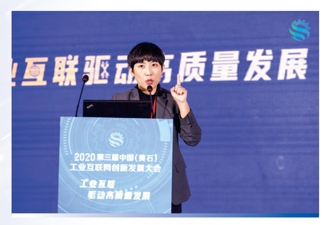
The Group participated in 2020 Industrial Innovation and Development Conference

In the intelligent digitalised products area, the Group now has two R&D centers, one in Bejing and the other in Chengdu, with the AI laboratory in Bejing offically named "Genesis AI Lab (富通恒先人工智能實驗室)". The two centers are together paticipating in the key national and provincial level research and development projects, helping improve the Group's innovation capabilities and developing AI algorithms so as to expand AI applications in various industries. Furthermore, to develop in depth AI technology and applications in the medical industry, the Group also joined the 冬奧會智慧醫療保障關鍵技術("the Olympic Winter Games Intelligent Medical Protection Key Technology Project), which is a key "Technology Winter Olympics" R&D project approved by the Ministry of Science and Technology.