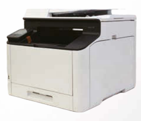
A4 Color Printer co-developed by the Group and a Japanese customer of the Group