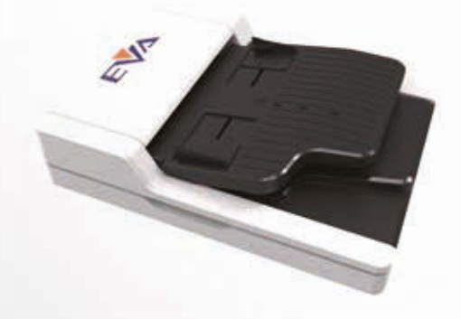
A4 Auto Document Feeder Scanner designed, developed and manufactured by the Group

the target outsourcing partner of certain key players in the OA equipment sector. In recent years, these key players have started to gradually scale down their own production lines in China for better focuses on marketing and business development, and hence they have been more willing to outsource their internal production to enlisted top-rated suppliers, such as the Group. With such favourable circumstance, the Group has seen an increase in order in-take from these major customers during the year ended 31 December 2020. As a result, we have seen an increase in the relevant turnover in Shenzhen by around 19%. Despite the outstanding performance in Shenzhen, we endured difficulties in Suzhou, as the orders on OA equipment from certain customers had dropped significantly as a result of suspension of offices and workforce on a global scale during the year, leading to a decrease in the relevant turnover by around 30%. In spite of the temporary lackluster performance in Suzhou, the Group remains confident in its outlook in the long run, save for the uncertainty of the pandemic's evolvement, as one-off unfavourable factors will begin to subside.