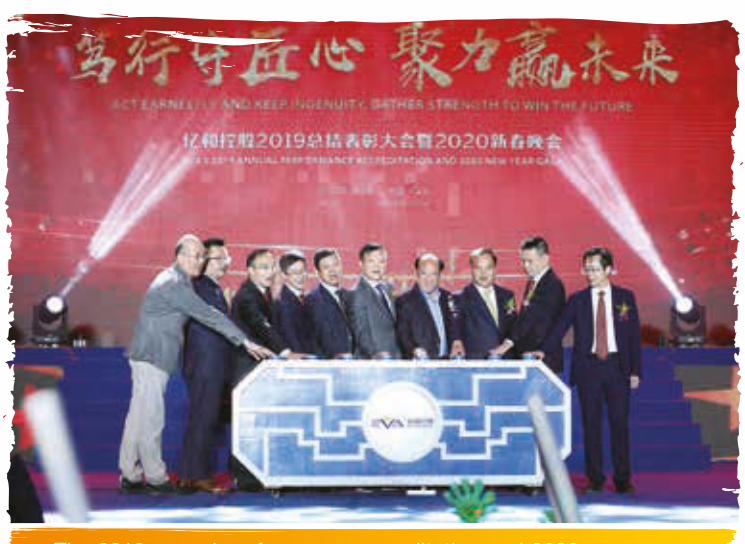
The 2019 annual performance accreditation and 2020 new year gala which was held in January 2020

The Group seeks to attract and retain talented employees through providing a work environment that promotes values such as fair play, respect and integrity. Compensation packages are competitive, and the promotion and rewards for employees are based on merits and the contributions that they can bring to the Group. Share options are offered to provide outstanding employees with opportunities to obtain an equity stake in the Group, thus fostering a sense of belonging and linking their interests with the interests of the Group. We believe this incentivises higher quality of work ethic and performance.