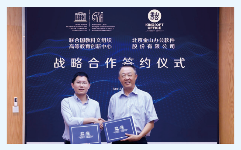
Kingsoft Office signed a strategic cooperation agreement with UNESCO

In June 2020, Kingsoft Office entered into a strategic cooperation agreement with the United Nations Educational, Scientific and Cultural Organisation (UNESCO) and joined the International Institute of Online Education under the International Centre for Higher Education Innovation of UNESCO. Online courses of the WPS Office are introduced to the international educational resource platform to improve the educational informatisation in developing countries in Asia Pacific and Africa. Kingsoft Office will also provide WPS office software for free to the "Smart Classroom" built by the International Centre for Higher Education Innovation of UNESCO in Asia and Africa. The offline Smart Classroom works with the online International Institute of Online Education to support higher education in developing countries.