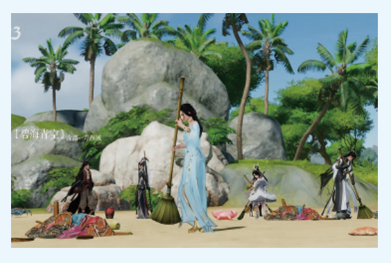
i Elements of marine protection integrated into Seasun Holdings games