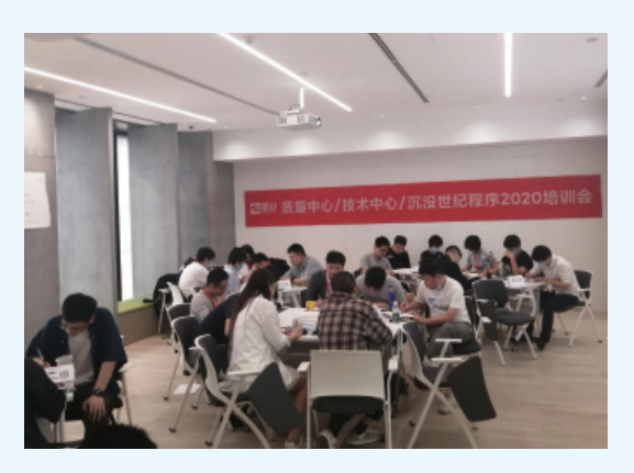
Workplace skills training

Kingsoft Office provides targeted training for employees at different levels. It Course evaluation helps improve training effectiveness. In 2020, Kingsoft Office organised 568 trainings of various kinds.