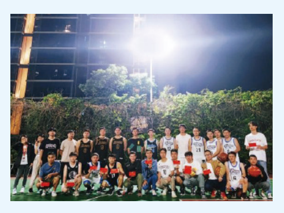
Basketball club of Kingsoft Office