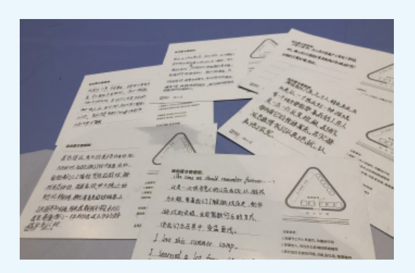
Thank You Letters to the Summer Camp