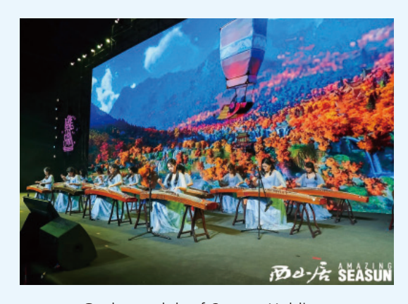
Guzheng club of Seasun Holdings

We organise various cultural and recreational activities to enhance employees' sense of identity and belonging to the Group. Seasun Holdings' Guzheng club has cultivated employees' artistic qualities and promoted Chinese traditional culture. Kingsoft Office's dance club has provided employees with training areas and performance opportunities to stimulate their vitality.