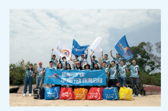
Enthusiastic players of Seasun Holdings organised "Clean Beach Action"

We encourage users to participate in environmental protection activities based on products. Seasun Holdings, together with public welfare organisations for environmental protection and enthusiastic players, held a public welfare activity named "Blue Sea Guardian - Clean Beach Action", which aims to cleaning up the beach and seafloor wastes in 11 coastal cities. Seasun Holdings also integrates design elements related to marine protection in its online game products, so that players will gain knowledge on marine conservation while playing games.