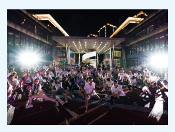
Seasun Holdings — Shining run