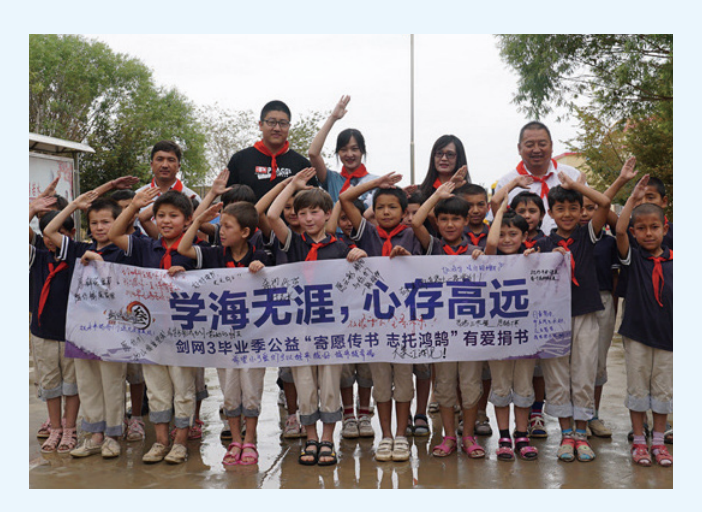
Book donation activities of Seasun Holdings

Since 2016, Seasun Holdings has been cooperating with players to donate books for primary and secondary school students in poverty-stricken areas to help them realise the "dream of reading". Seasun Holdings "Xi Fund" donated more than 43,000 books to primary and secondary school students in Honghe Autonomous Prefecture, Yunnan.