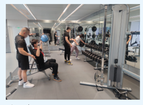
Fitness room for the Group's employees