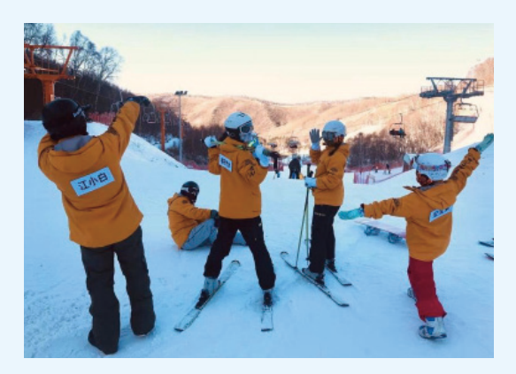
Ski club of Kingsoft Office