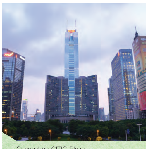
Guangzhou CITIC Plaza 廣州中信廣場

第一季過後經濟復甦帶動住宅物業銷售,令整體收入錄得增長14%。住宅物業之已確認銷售較去年上升29%至644,500,000港元,惟商用物業的租賃收入則下跌7%。毛利下跌3%至662,200,000港元。本集團不但沒有二零一九年所錄得的投資物業重估收益91,900,000港元,反而錄得投資物業重估虧損98,400,000港元。因此,本集團之盈利下跌36%至241,600,000港元。