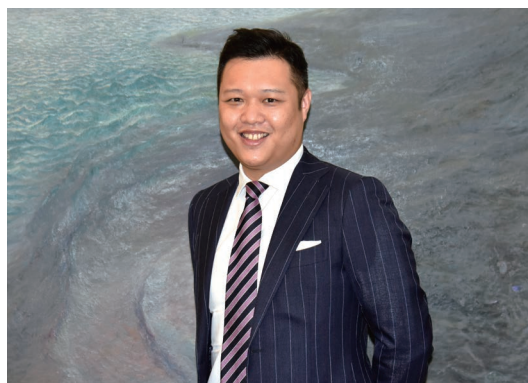
"The supreme art of war is to subdue without a fight", Raymond Tam 「不戰而勝為戰之至上技藝」· 譚家熙