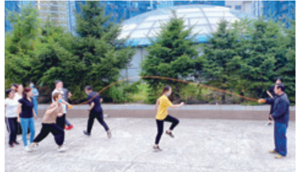
The Shenyang Rich Gate held a rope skipping competition to celebrate the Dragon Boat Festival in June 2020.

The Group standardised our remuneration system. We follow the principles of “two equalities”, referring to internal and external equalities, and “three matchings”, referring to the assurance that individual remuneration matches the relative value of the position and matches the ability, performance and potential, and that the total remuneration matches the benefits of the Group, aiming to provide competitive remuneration to employees. In performance evaluation, the Group follows the principles of “fairness and openness, objectivity and justice, open communication and compulsory distribution”. Employees are assessed for their decision-making ability, leadership, sense of responsibility, consciousness of learning and innovation and other indicators. The performance evaluation results are used as the basis for salary adjustment.