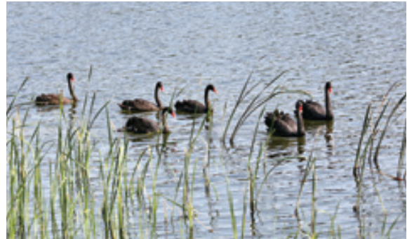
Black swans at the Golf Course