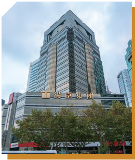
TOMSON COMMERCIAL BUILDING 湯臣金融大廈

來自本集團位於浦東之商業及工業物業組合(其中包括湯臣金融大廈、湯臣國際貿易大樓、湯臣外高橋工業園區、湯臣商務中心大廈之商場部份及上海環球金融中心72樓全層辦公室物業)之租金收入及管理費為本集團帶來穩定經常性收入約101,940,000港元，佔本集團於回顧年度內之經營收益總額約10.89%。在2019冠狀病毒病之疫情下，部份上述物業向合適租戶提供租金優惠，故租金收入輕微減少。此外，本集團於二零二零年度之全年業績中就上述投資物業錄得公平值變動所產生之未變現虧損淨額約5,400,000港元。