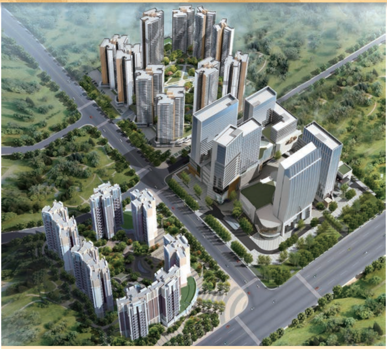
Regal Cosmopolitan City, a composite hotel/commercial/office/residential development in Xindu District, Chengdu, Sichuan (*)