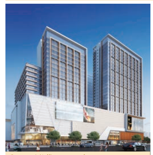
Commercial/office towers of Regal Cosmopolitan City (*)