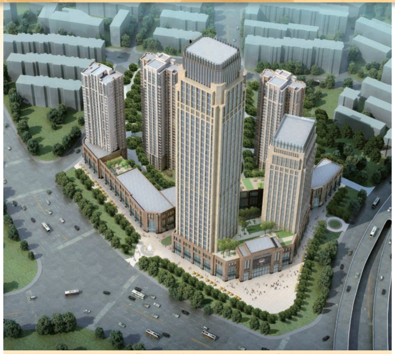
Regal Renaissance, a composite commercial/office/residential development in a prime location of Hedong District, Tianjin (*)