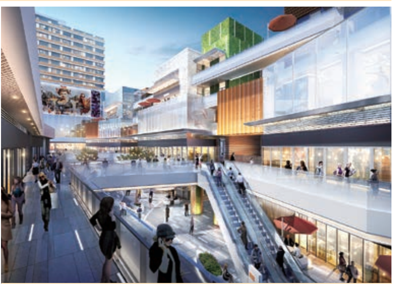
Shopping mall at Regal Cosmopolitan City (*)