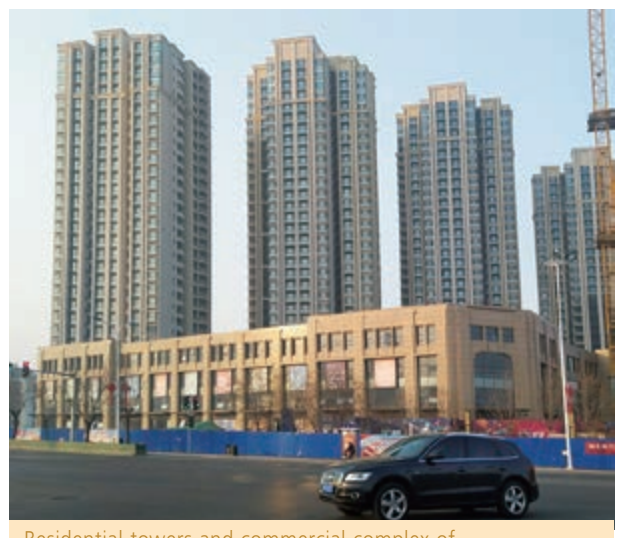
Residential towers and commercial complex of Regal Renaissance - completed