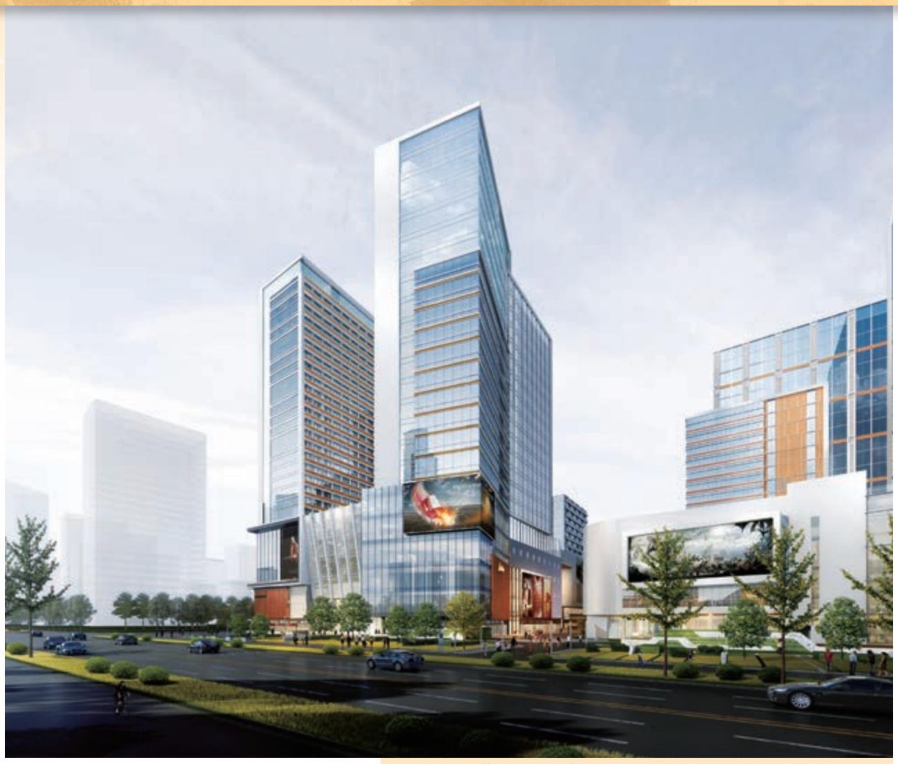
Commercial/office towers of Regal Cosmopolitan City (*)