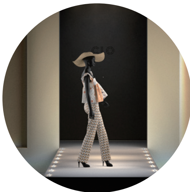
3D Fashion Design Software

In addition to advancing digital transformation in the manufacturing sector, High Fashion has also achieved astounding breakthroughs in our real estate projects in 2020. High Fashion Centre in Hong Kong has completed revitalisation in mid-2020, and part of it was converted into a fashion business ecosystem and shared centre. WL District in Hangzhou has been selected to be the temporary site of a provincial-level research institute with acknowledgement and blessings from local provincial government. The two projects would continue to provide a significant and stable rental income for the Group. We anticipate WL District would become a high-tech fashion hub that attracts related talents and potential projects.