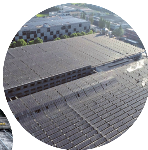
Solar Energy System