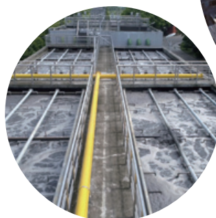
Wastewater Treatment System

High Fashion adheres to its people-oriented philosophy to create a respectful, inclusive and engaging workplace to the staff. Through a diverse set of internal and external training programs, we aim to maximise the potential and contributions of our staff to our success. The Group also incorporated this philosophy in the offices and facilities designs, to create a more relaxing and comfortable workplace for our staff.