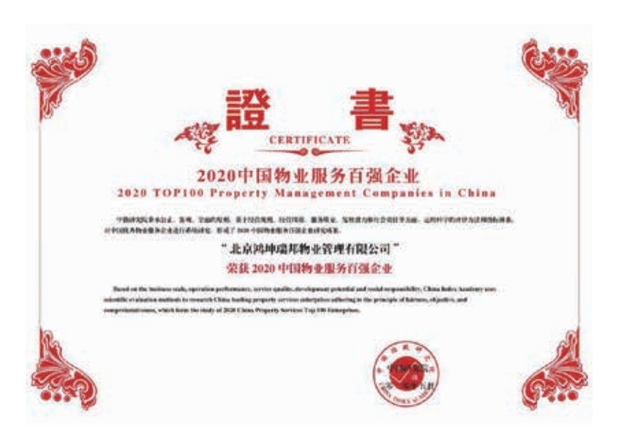
We ranked 44th among the 2020 China Top 100 Property Management Companies 榮獲「2020中國物業服務百強企業」第44位