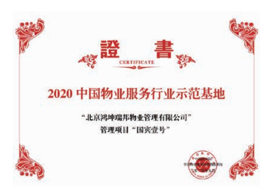
"National Guest No. 1" project won the 2020 China Property Service Industry Demonstration Base 國賓一號項目榮獲「2020中國物業服務行業示範基地」