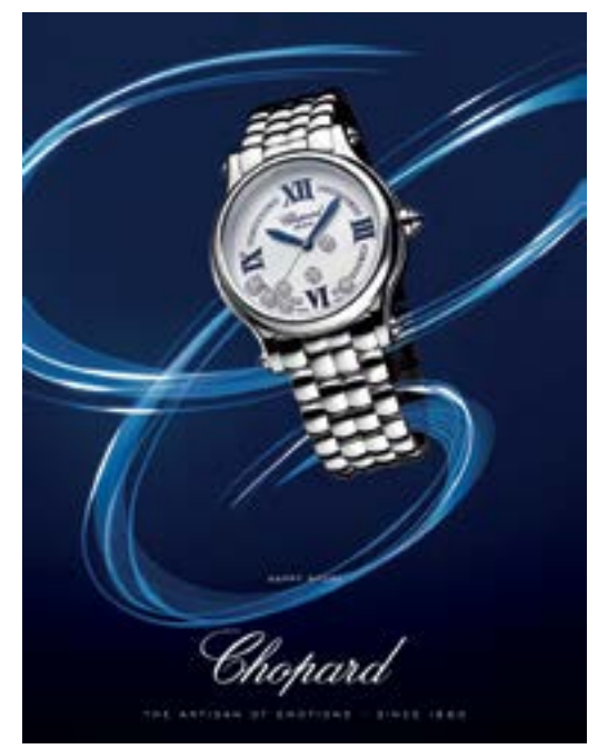
Chopard 'HAPPY SPORT' watch. 「蕭邦」的「HAPPY SPORT」腕錶。