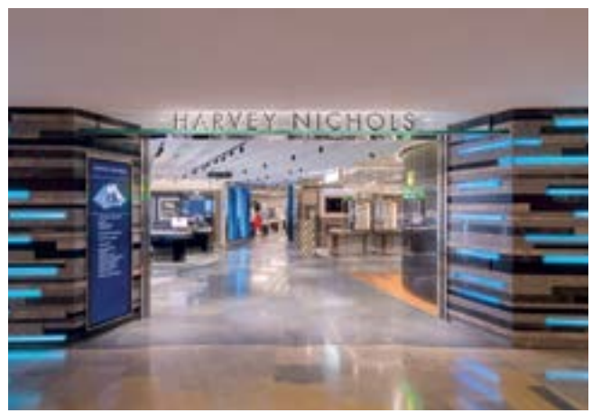
Harvey Nichols store at Pacific Place, Hong Kong. 位於香港太古廣場的「Harvey Nichols」店。

In terms of sales mix, watches and jewellery represented 45.9 per cent., cosmetics and beauty products 29.2 per cent., fashion and accessories 20.0 per cent. and securities trading 4.9 per cent..