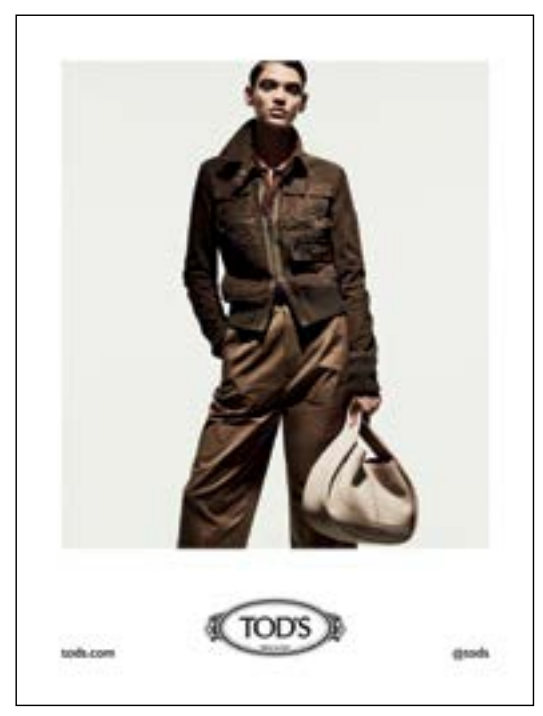
Handbag by Tod's. 「Tod's」手袋。

The investment market has continued to be very volatile as a result of the worldwide impact of COVID-19. The Group continues to manage its investment portfolio cautiously and has succeeded in achieving a profit of HK$89.3 million during the year ended 31st March, 2021.