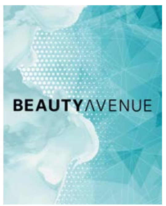
Beauty Avenue, the new beauty retail concept. 「Beauty Avenue」- 一站式化妝美容概念店。