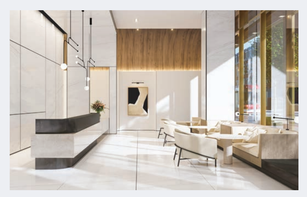
A rendering of the residential lobby of 88 South, the third phase at the Group's 88 Queen city-block mixed-use development in downtown Toronto, Canada.

During the period under review, the COVID-19 pandemic continued to have a negative impact on the world markets and the Group's watch manufacturing and trading division was adversely affected.