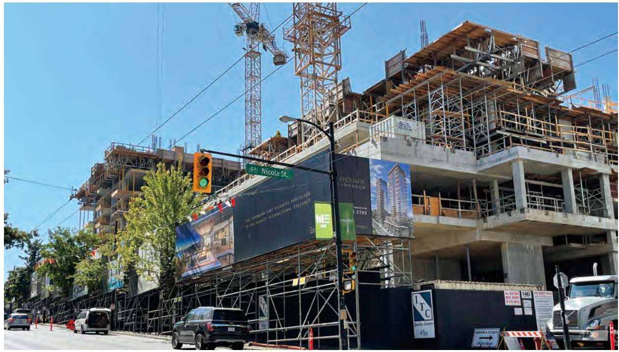
Development project "Landmark on Robson" in Vancouver, Canada

Our Group had experienced a challenging year with COVID-19 pandemic disrupting all facets of economic activities around the globe. However, during this unprecedented time, the Group remained financially prudent and cautious and is pleased to achieve a consolidated net profit of HK$ 622 million for the year, an increase of 62% over last year.