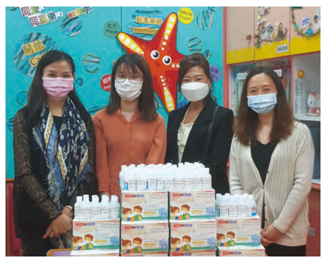
Hotel representatives presenting the anti-epidemic supplies to the Superintendent of the SAHK Apleichau Pre-school Centre (far right)

"The Art of Caring" Community Care Program was launched in 2009 by the Empire Hotels in conjunction with SAHK, a rehabilitation service organisation. Since then, the program has been giving support to local children and youth with special needs in their education and rehabilitation through creation of art pieces and a series of educational workshops, learning events and life enriching activities. With over ten years of unrelenting, concerted efforts with SAHK, in 2019, the Empire Hotels group was awarded the "10 Years + Caring Company Logo" by the Hong Kong Council of Social Service ("HKCSS") to recognise its contribution to the community.