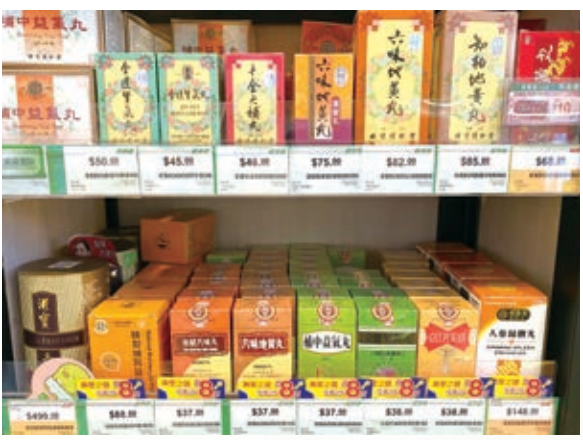
Highlights of the Healthcare Products Segment