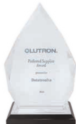
LUTRON "Preferred Supplier"