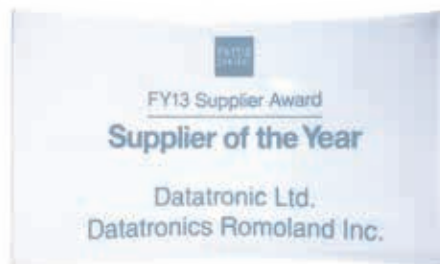
PHYSIO CONTROL "Supplier of the Year"