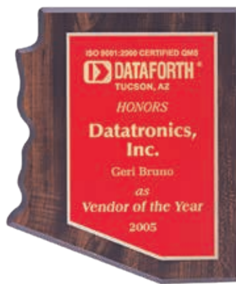
DATAFORTH "Vendor of the Year"