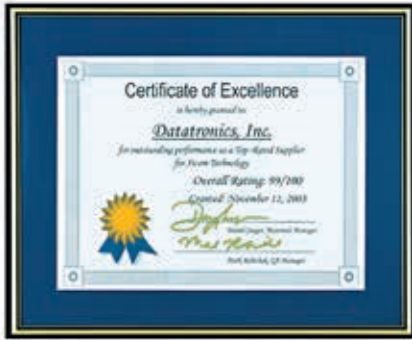
XICOM "Outstanding Performance"