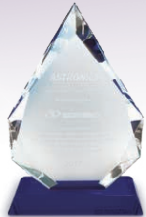
ASTRONICS "Customer Intimacy Strategy"