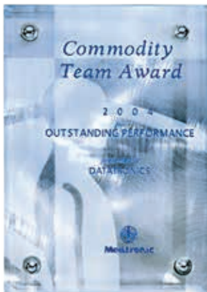
MEDTRONIC "Outstanding Performance"