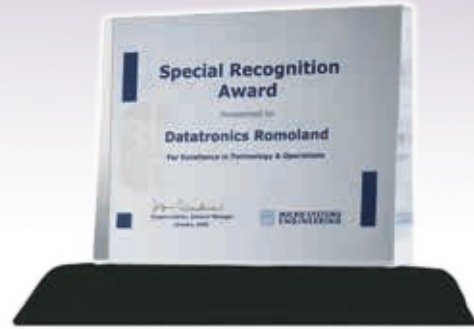
MICRO SYSTEMS ENGINEERING "Special Recognition Award"