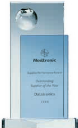
MEDTRONIC "Supplier of the Year"