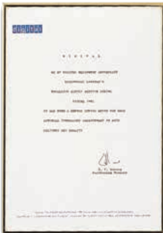
Digital Equipment corp