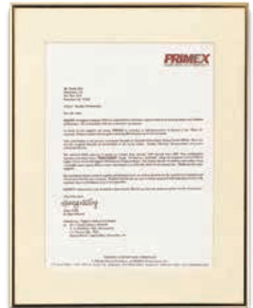
Preferred supplier Primex Aerospace