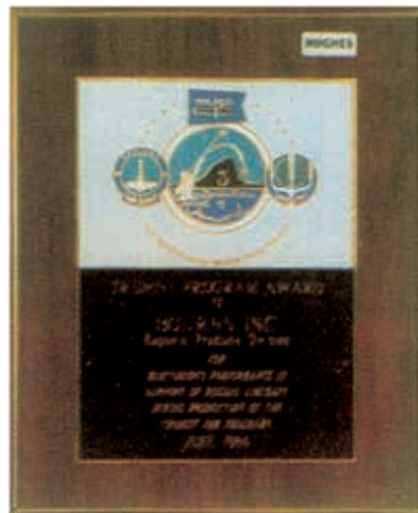
Hughes Aircraft General Motors