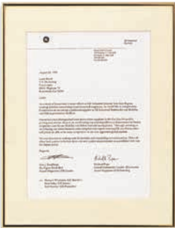
Preferred supplier General Electric