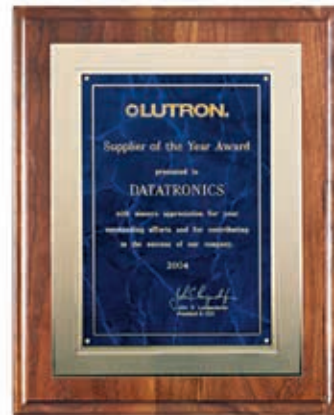
LUTRON "Supplier of the Year"