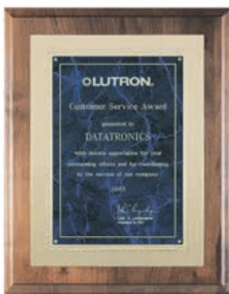
LUTRON "Customer Service"