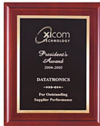
XICOM "President's Award"