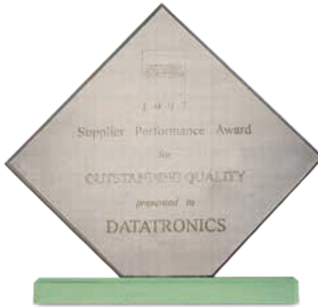
Physio Control (Div. of Medtronic)