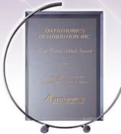
ASTRONICS "Best Value Added"