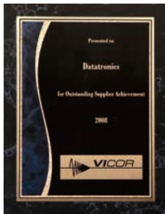
VICOR "Outstanding Supplier Achievement Award"