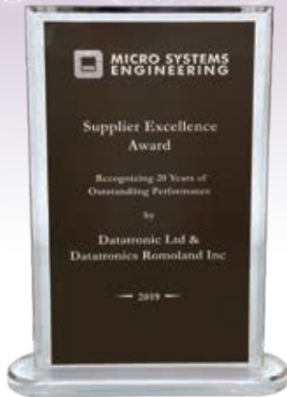
MICRO SYSTEMS ENGINEERING "Supplier Excellence"