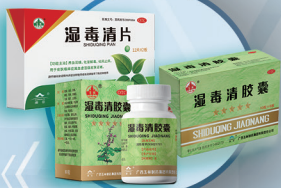
皮膚科藥物 Dermatologic Medicines