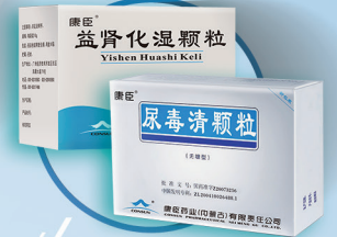
腎科藥物 Kidney Medicines