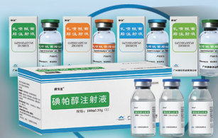
對比劑 Contrast Medium