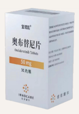
(宜諾凱®, Orelabrutinib, BTK inhibitor)

On 26 April 2021, Orelabrutinib was included in the Chinese Society of Clinical Oncology ("CSCO") Diagnosis and Treatment Guidelines for Malignant Lymphoma 2021 (the "Guidelines") and is listed as a Class I recommended regimen for the treatment of r/r CLL/SLL and r/r MCL. In the Guidelines, Orelabrutinib is recommended as treatment options for r/r diffuse large B-cell lymphoma ("DLBCL") and primary central nervous system lymphoma ("pCNSL") based on preliminary clinical studies.