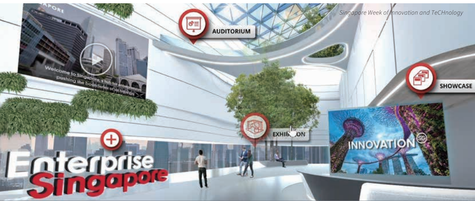
Singapore Week of Innovation and TeCHnology