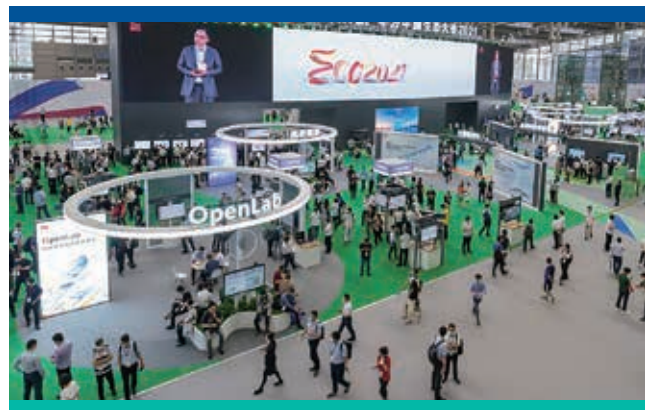
Huawei Eco in Shenzhen

During the year, we continued to see travel restrictions and social distancing requirements imposed and revised in many countries where the Group operates. However, in opened markets, a resurgence of physical events has been observed, though generally of a smaller scale and complemented with digital activation. As a result, there has been an increase in both the total number of exhibitions by 23% and total exhibition space by 92% with Pico appointed as official service provider compared to the previous year. Though a welcome improvement, this performance does not match the level attained in pre-COVID 2019.