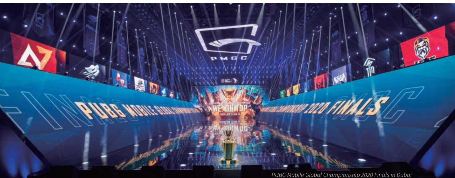
PUBG Mobile Global Championship 2020 Finals in Dubai

Major exhibitions completed during the year with Pico appointed as official service provider include: