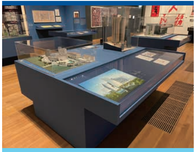
M+ Museum of visual culture in Hong Kong

In Hong Kong, contracts delivered included the Earth Science Gallery at Hong Kong Science Museum, the Sik Sik Yuen Gallery at Wong Tai Sin Temple, and the M+ Museum of visual culture in the West Kowloon Cultural District. After a temporary halt due to the pandemic, the Group’s work for the theme park on Lantau Island resumed and is expected to be completed in 2022.