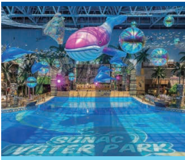
Sunac theme parks in Chongqing, Jinan and Wuxi

In mainland China, completed themed entertainment projects included a Hollywood movie theme park in Beijing, Sunac theme parks in Chongqing, Jinan and Wuxi, and the Shanghai Astronomy Museum.