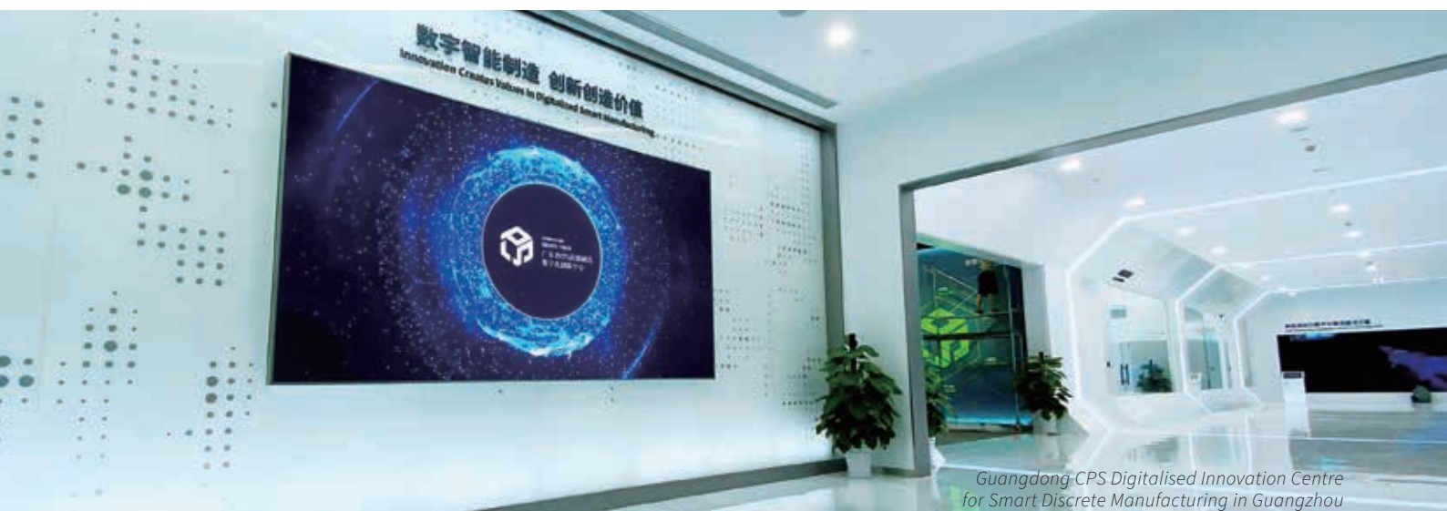
Guangdong CPS Digitalised Innovation Centre for Smart Discrete Manufacturing in Guangzhou