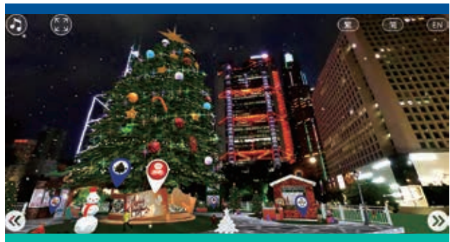
Hong Kong Winterfest's virtual tour of Christmas Town

In Singapore, we delivered DBS Transformation Week 2020. A series of virtual events were delivered for HP Inc in Asia, UK and US. Also in the US, a wide variety of virtual events were delivered, ranging from a video game show to a civil rights convention. The Group also activated the inaugural Chief of Army Symposium in Brisbane, Australia.